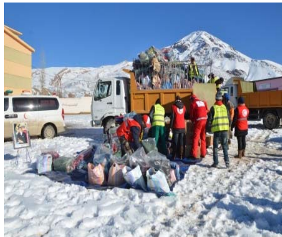
Figure 1. MRCS volunteers distribute lifesaving assistance in Guecif Province

The heavy rains were greeted with relief by farmers, who were worried about the prolonged drought conditions. Since November 2017, the government has taken measures to deal with the drought and a subsequent difficult agrarian year. Pastoralists and farmers received aid, however with very low temperatures the situation worsened. Economic losses have spiked, prices have risen, livelihoods disrupted and cold-related diseases such as hyperthermia and bronchitis, flu and pneumonia have increased. In response, the Government declared a state of emergency, instructing all Ministries and Civil Society,