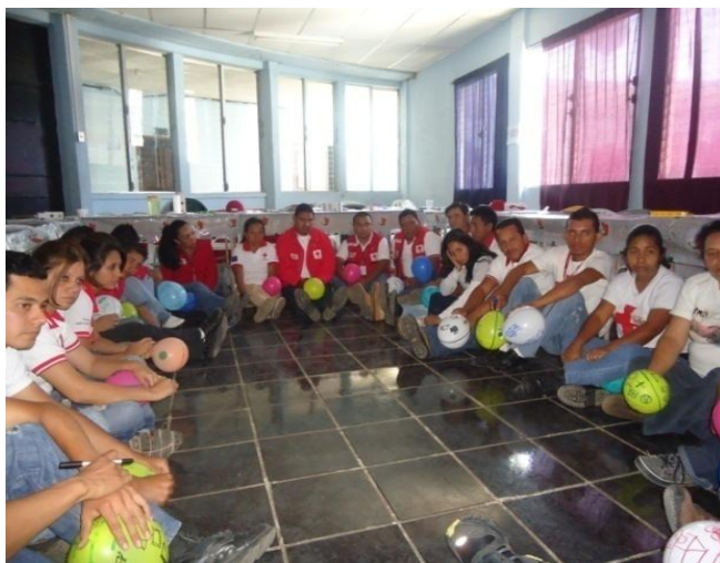
Twenty six volunteers of the GRC were trained on how to provide psychosocial assistance to affected families.

Second, 436 families from 9 communities in the departments of Alta Verapaz and Petén were reached with psychosocial support , 48.4 per cent of the original target. To complete this, the National Society first trained 26 volunteers from nine branches whom then were mobilized to provide assistance to the selected communities. The workshops for volunteers also had the support of psychologists from the San Carlos de Guatemala University who are certified by the United Nations as facilitators of UNICEF's Return to Happiness methodology. As a result of this activity, GRC volunteers were able to provide assistance in relation to the emergency crisis, enabling persons to vent their fears, and support the community emotional recovery. With the support of games and mimes, the adult members of the selected families received information on the importance of recreational activities, as well as introspection and self-assessment. Furthermore, the GRC also worked directly with the communities' children through activities in the schools.