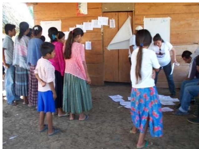
Members of the community Las Brisas, Department of Alta Verapaz, receive participates in hygiene promotion and sanitation activities.

The household water filters distributed enable families to have access to 10 gallons of safe drinking water every 24 hours for one year. The 1,500 filters distributed are equivalent to the distribution of 5,475,000 gallons (24,911,250 litres) of safe water for one year. To ensure that the filters are properly used and cared for, the National Society coordinated with the company providing the filters so they could provide training to beneficiaries.