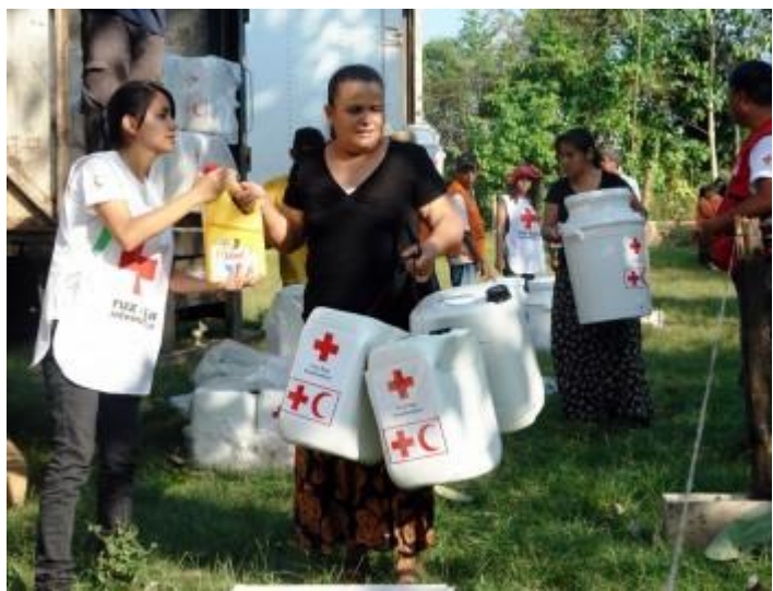
The Guatemalan Red Cross (GRC) met the immediate needs of some 9,000 persons affected by the Tropical Depression 12-E with the support of the Emergency Appeal.

Summary: In October 2011, Tropical Depression 12-E severely affected all countries in Central America. Its intense rains caused flooding and landslides in Guatemala as the soils in the country were already saturated and river levels high due to previous precipitations. The weather front affected more than 500,000 persons in Guatemala, of which 82,913 were severely affected. Given the situation, the Guatemalan government decreed a State of Public Calamity on 16 October, and the National Society developed a Plan of Action to assist some 7,500 beneficiaries (1,500 families).