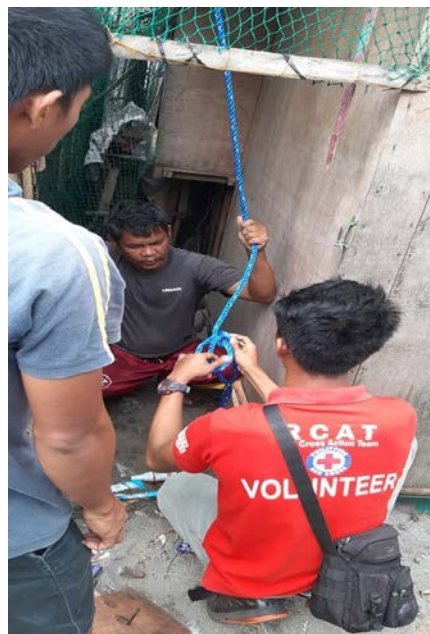
Brace before impact. Philippine Red Cross volunteers help strengthen houses before typhoon Kammuri hits.