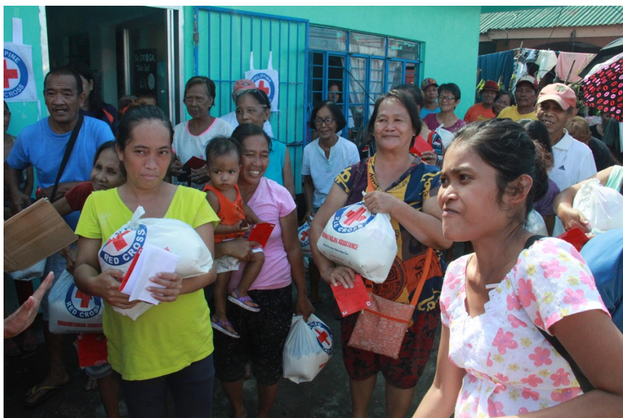
The Philippine Red Cross immediately responded and distributed relief to affected families of typhoon Kammuri in Bicol.

A total of 2,461 affected families have also received other food assistance, including food ration packs (1,920 families), rice and sachet food (432), which have been funded through PRCs own resources.