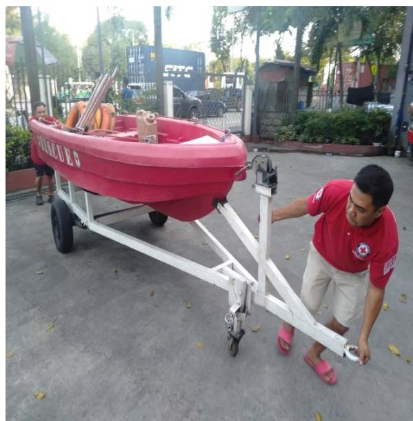
The IFRC was able to release an emergency fund pre-landfall to support the Philippine Red Cross in mobilizing its teams in branches and deploy assets and essential relief items to strategic locations in the predicted path of the typhoon. This resulted in an effective, efficient and local response. The Red Cross continues to assist communities affected by the disaster and help them get back to their normal lives and recover their losses through multi-purpose cash grants.