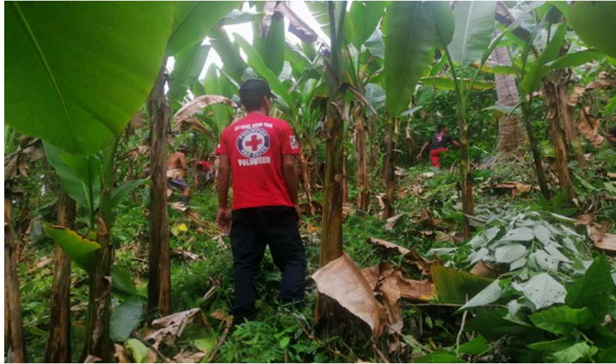
Forecast-based financing (FbF) was used to help abaca farmers to harvest their crops before the typhoon hit. In past storms, when abaca trees were destroyed, this not only meant significant losses for farmers but also serious loss of income for those workers normally employed in processing their fiber. Livelihoods, trees – and incomes – were protected, with Red Cross help.