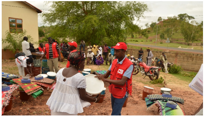
Distribution of relief materials to the affected people by volunteers

The identification and registration of the targeted beneficiaries was carried out. The preliminary data generated from the rapid assessment report was used. Indeed, GRCS deployed volunteers in the field for five days using the data to verify and register the affected families. This verification and registration exercise were done in close collaboration with the community leadership (village development committees, and the head of the village), the National Society's executive was informed and involved in the verification process. The list of the final targeted beneficiaries was shared with the authorities and the National Disaster Management Agency (NDMA)