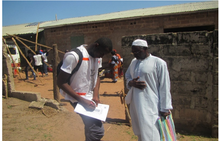
Feedback mechanism: a volunteer assessing any claim with targeted person

The purpose of the training was to ensure that all staffs of the National Society have a very good understanding of the procedure and process of applying for DREF. This would help GRCS in the future to avoid unnecessary delays in the process.