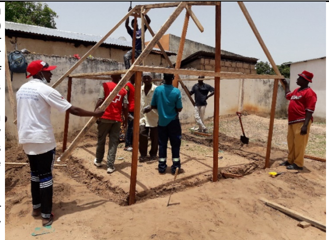
Practical exercises on construction of emergency shelter, in 2 hours

community level. It targeted a total of 30 volunteers (15 from Central River Region (CRR), 15 Upper River Region (URR) who were trained on emergency shelter and build back safer on 13 and 14 July 2019 at the URR Branch Office by the RDRT Shelter. This was also attended by the two Branch officers of CRR and URR and GRCS logistics. The GRCS DM staff was part of the training as facilitators. The IFRC team comprised of the DM and Logistics staff took part to the opening session of the training. The National Disaster Management Agency (NDMA) also attended the session. The Governor of URR was informed of the training as well although she did not attend the training.