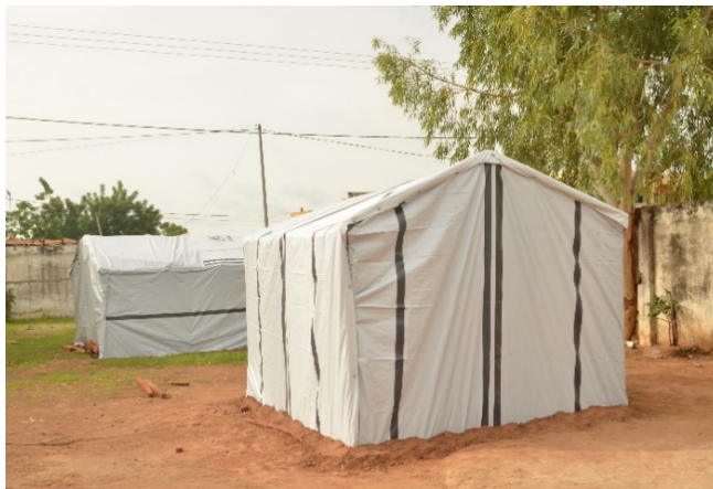
Finished emergency shelter constructed by volunteers

Through this DREF operation, the Gambian Red Cross Society was able to support a total of 400 families (3,600 people) in CRR and URR with emergency shelter and related needs. Indeed, the National Society responded to the above-mentioned windstorm by delivering assistance to 3,600 people 1 in the Eastern Regions of Central and Upper River Region (CRR & URR). The operational teams worked to ensure the timely completion of the 400 shelter assistance materials for 400 households. Each family was supported with 20 iron sheets, 3kg of nails, 25 woods for trusses, 9 bars of soaps, 2 buckets, 3 mats, 1 kitchen set, 2 tarpaulins, 2.5kg of galvanized wire and 1 shelter kit.