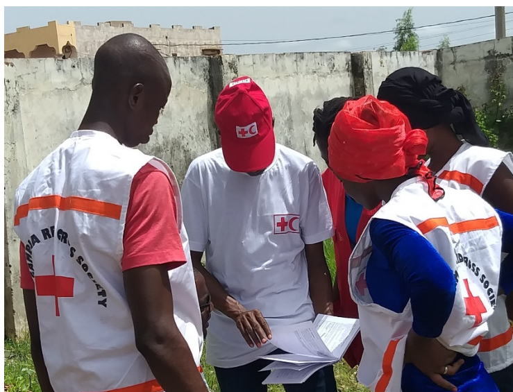
The GRCS volunteers were engaged in the DREF activities

On 19 June 2019, a windstorm surge hit through five (5) regions in the Upper River Region (URR) namely; Jimara, Tumanna, Wuli East, Wuli West and Sandu districts as well as two districts of Central River Region (CRR) namely Upper Fulado East, Upper Fulado West and Niani, of Gambia, affecting 67 communities. The windstorm surge affected over 900 families (8,100 pax) and caused internal displacement, injuries and 4 deaths (3 in URR and 1 in CRR). The Gambia Red Cross Society (GRCS) and National Disaster Management Agency (NDMA) indicated that over 15,000 people were affected, including 1,425 people displaced, among whom many were hosted by relatives, extended families and neighbors and others were temporarily hosted in evacuation centers.