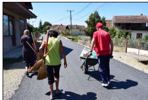
Image 7 - RC Distribution of household cleaning set in Svilajnac.