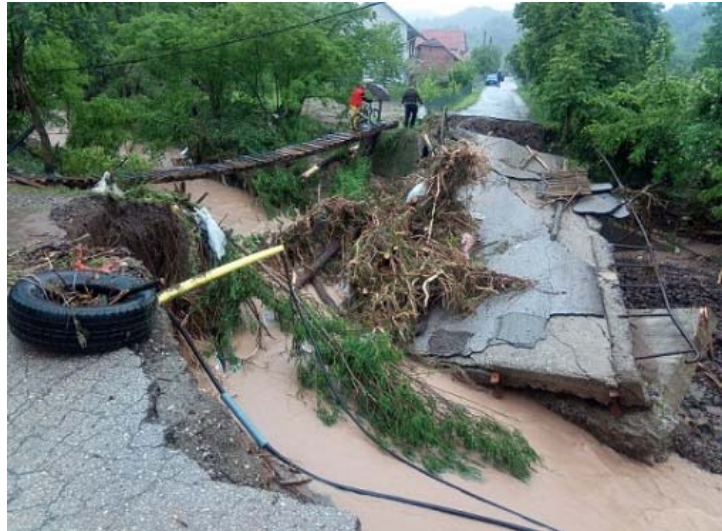
Image 1: Flooded area and collapsed infrastructure in Kraljevo, Sirca.

In the last two weeks of May 2019, Republic of Serbia was affected by heavy rain and hailstorms. On 3 June 2019, Moravicki, Raski, Sumadijski and Pomoravski districts were affected by floods and flash floods due to the heavy rainfalls (80-100 litres per square meter). 20 cities and municipalities in the central and western parts of Serbia (Kraljevo, Novi Pazar, Paracin, Sremska Mitrovica, Knic, Arilje, Lucani, Tutin, Trstenik, Pozega, Vrnjacka banja, Koceljeva, Rekovac, Gornji Milanovac, Ljig, Cacak, Ivanjica, Aleksinac, Prokuplje and Krupanj) were reported to be affected by flash floods and floods as a consequence of the heavy rains. Several hundreds of hectares of agricultural land have been destroyed. 13 municipalities declared state of emergency on 3 June, and following more rainfalls, additional seven municipalities declared state of emergency between 5 and 7 June 2019.