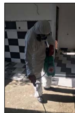
Image 5: Red Cross teams conducting disinfection of flooded households.