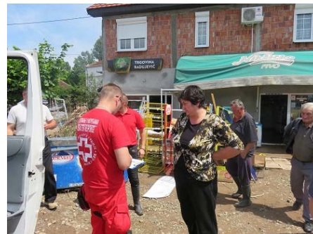
Image 3: Kraljevo RCB rapid assessment.

RCS maintained close communication and coordination with IFRC Regional Office for Europe (ROE) and the regional RCRC Movement partners, such as the Bulgarian Red Cross and the Red Cross of North Macedonia, which were informed about the situation. Given the capacity and vast experience of RCS in responding to floods and other disasters,