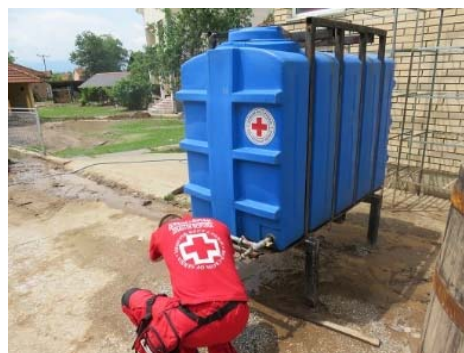
Image 4: Distribution of water reservoirs.