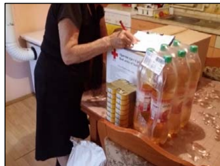
Image 8- RC Distribution of Family food packages in Koceljewa.

Among the selected 650 households, 911 people (257 families), who were considered to be the most affected and those who were living on poverty line received unconditional cash grant (CHF 255 per family) for flood destroyed livelihoods and basic needs. To select the most affected and vulnerable people for cash assistance, the rapid assessment data was cross-checked with data from the damage assessment, which is done by the state authorities. Damage assessment was a slow strictly administrative process most of the time lasting for months. Therefore, it was decided to cover the needs of the most affected people with in-kind food assistance until the list of targeted people for cash assistance was completed. The process of selection took place with the help of the local Red Cross branches, who had lists from the local commissions. In this list households were classified from 1 st (less damage) to 6 th category (worst damage – house at risk for living). Local Red Cross branches were cross checking this data with data from detailed assessment, local social welfare institutions and health institutions.