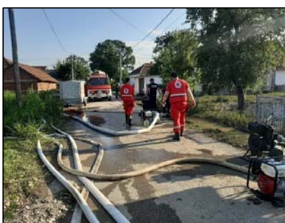
Image 6: Red Cross teams pumping out water from flooded area.