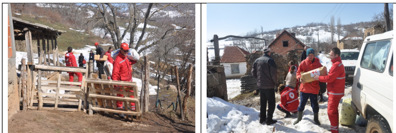
Distribution of relief by RC volunteers to affected families living in remote areas.

The International Federation of Red Cross and Red Crescent (IFRC) Disaster Relief Emergency Fund (DREF) is a source of un-earmarked money created by the Federation in 1985 to ensure that immediate financial support is available for Red Cross and Red Crescent emergency response. The DREF is a vital part of the International Federation's disaster response system and increases the ability of National Societies to respond to disasters.