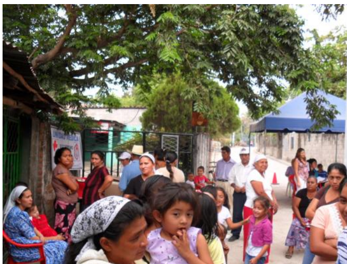
Communities in El Salvador are reached through health care days carried out by Red Cross volunteer.

In support of the national plan launched by the National Civil Protection System, SRCS will complete educational talks and cleaning campaigns in 60 schools and communities, will distribute informative materials in shopping centres, will carry out a mass media campaign, and will support the referral of suspected cases.