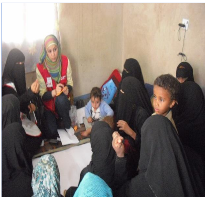
Assessment team field visit and interaction with local communities in the suburb of Sana'a.

assessments have shown that governorates in the south, west and north of the country are all at a critical level in terms of malnutrition. In a chronically underdeveloped country, characterised by unrest and