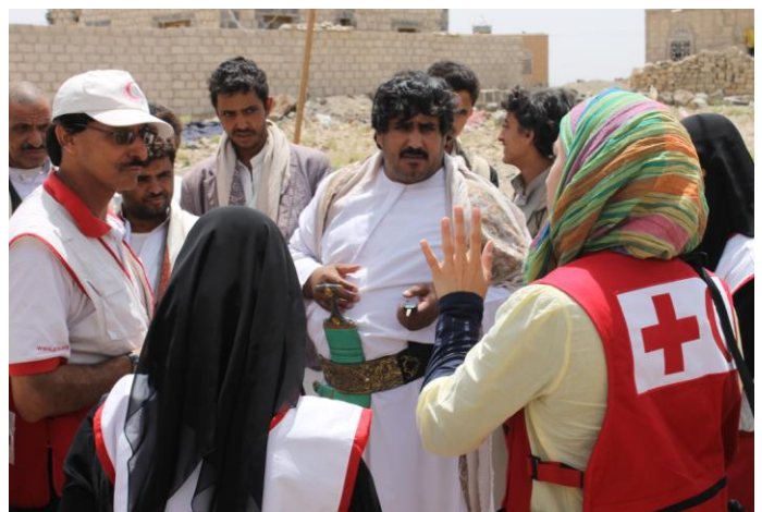
Meeting with community leader during the field visit to the rural area of Sana'a.

Recent reports in July 2012 from Sana'a have stated that one million children in Yemen under the age of five are estimated to suffer from malnutrition, as families struggle to pay for food in one of the Arab world's poorest countries. Susceptible to common conditions and diseases such as diarrhoea, malaria and acute respiratory infections, 267,000 children are at risk of dying without proper nutrition interventions. Many more are vulnerable to longer-term and often irreversible health problems.