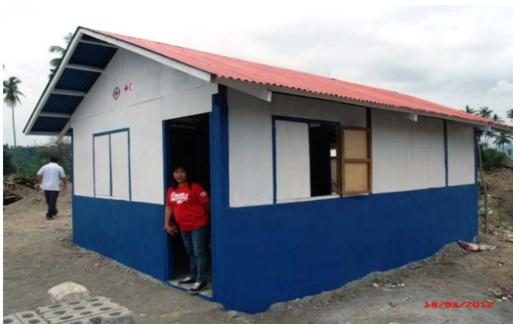
One of the model houses constructed in Iligan City, after Typhoon Washi

This report covers the period 01 January 2012 to 30 June 2012