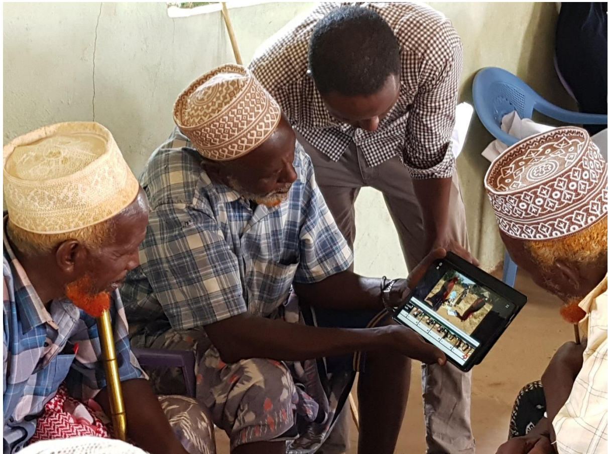
Elderly representatives editing their stories on Indaba.