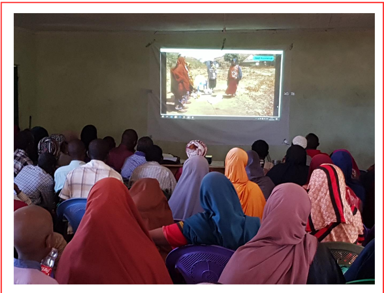
Community feedback screening in Yabello, Kenya.

At the end of this Participatory Video Rapid Review on day 5, the community representatives were able to share their video stories with their peers through a community screening.