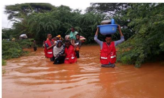
Photo: Affected community members being evacuated by KRCS volunteers (KRCS)

5 th December 2019: IFRC launches an Emergency Appeal for 2.5M Swiss francs to assist 150,000 people for a period of 12 months