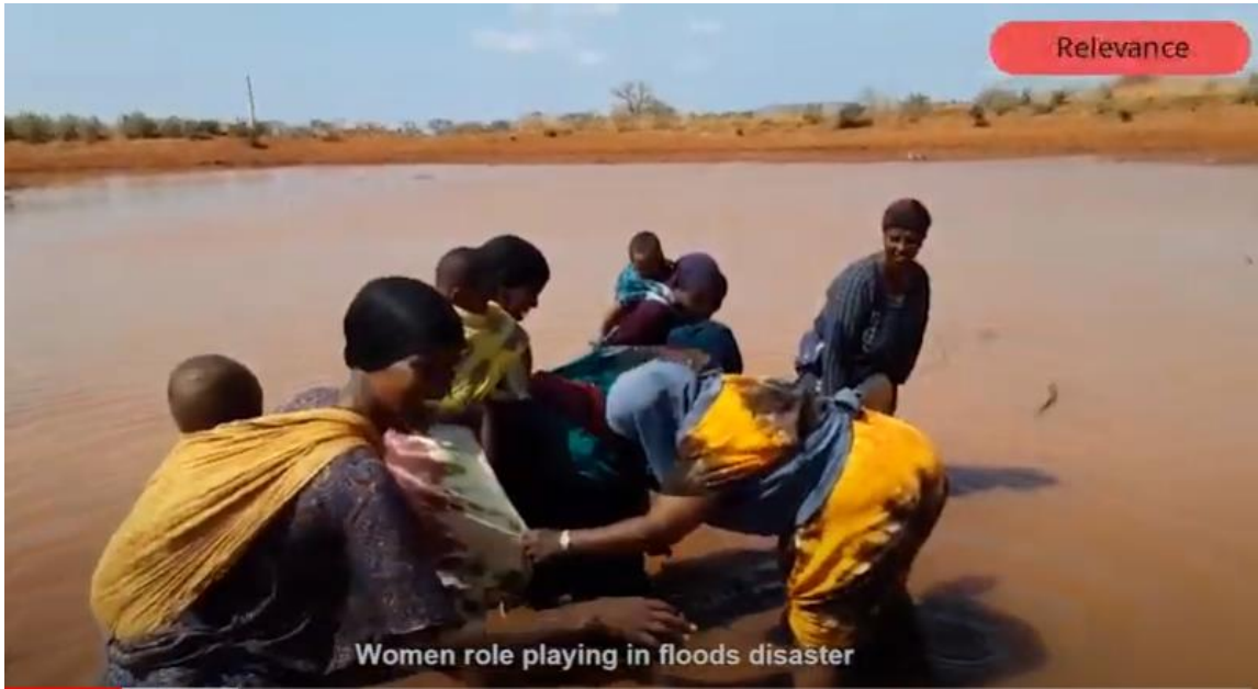
Indaba: Participatory Video Rapid Review (Community) post floods in Marsabit county in October 2019