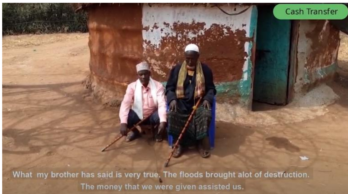
Indaba: Participatory Video Rapid Review (Elderly) post floods in Marsabit county in October 2019