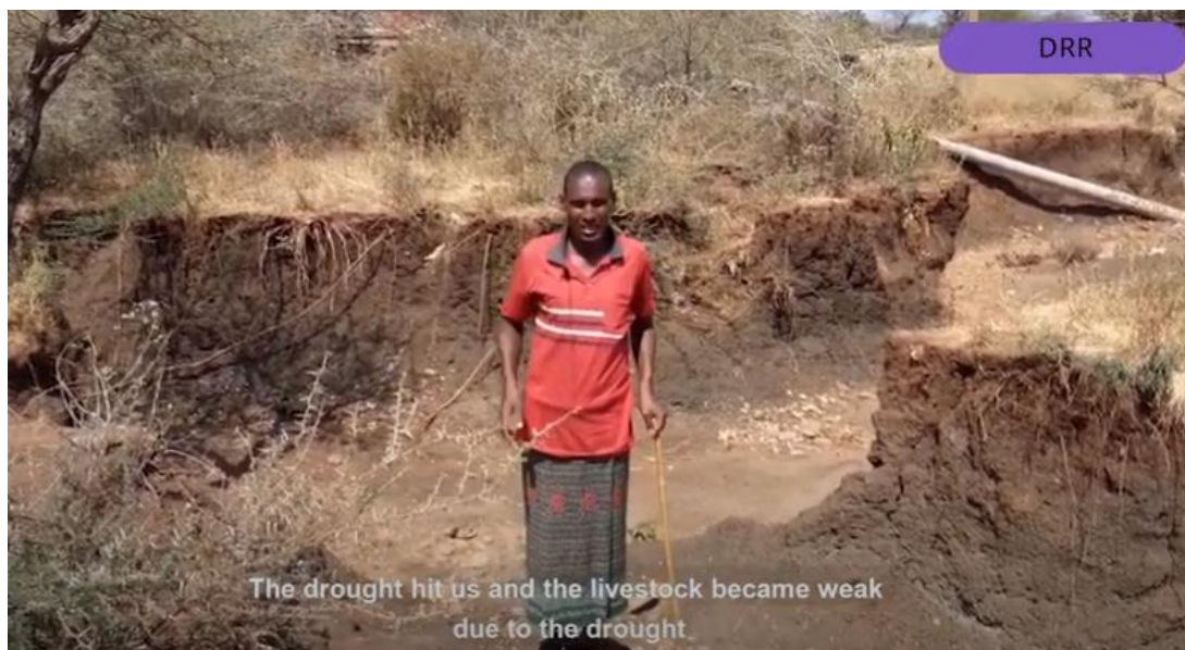
Indaba: Participatory Video Rapid Review (Men) post floods in Marsabit county in October 2019