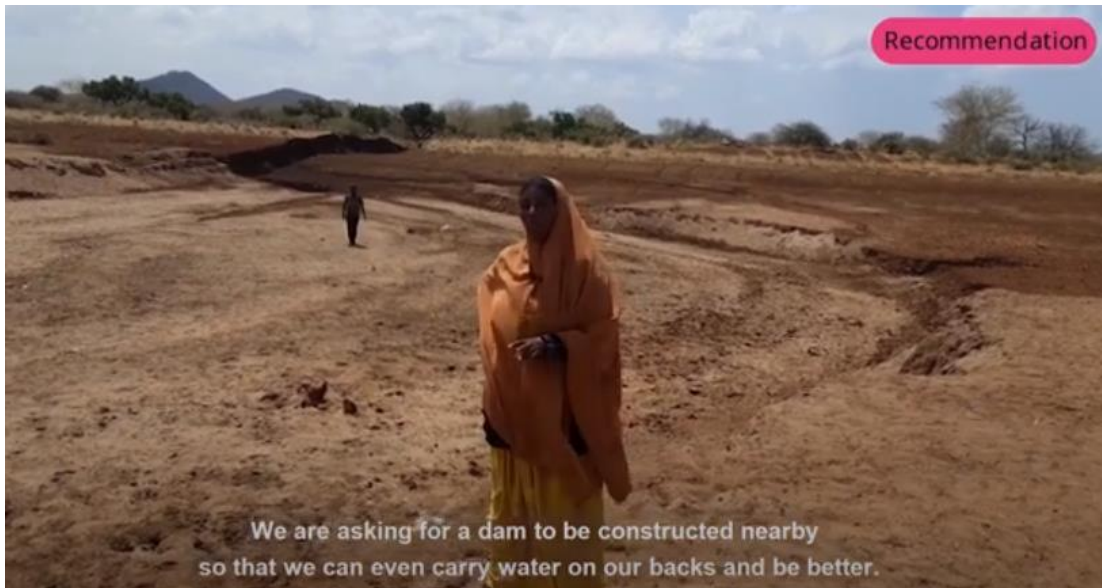
Indaba: Participatory Video Rapid Review (Youth) post floods in Marsabit county in October 2019