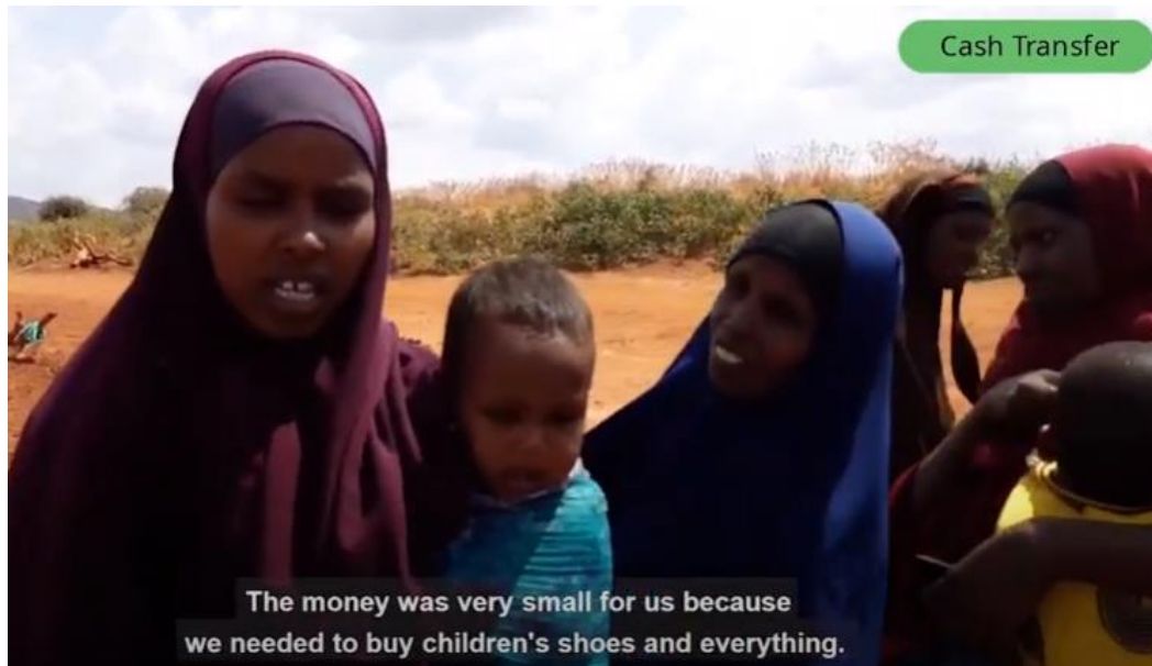
Indaba: Participatory Video Rapid Review (Women) post floods in Marsabit county in October 2019