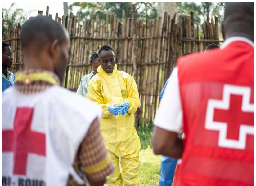
More than 150 trained Red Cross volunteers have been reactivated as part of a first wave of response to the latest Ebola outbreak in the Équateur Province, in the western part of Democratic Republic of the Congo.

Experience IFRC resources previously active responding to EVD in Equateur, North Kivu and Ituri, have been deployed to provide technical assistance and coordination with other actors. The DRCRC, in turn, has begun responding to cases and deaths with Safe and Dignified Burials (SDB) and Risk Communication and Community Engagement (RCCE).