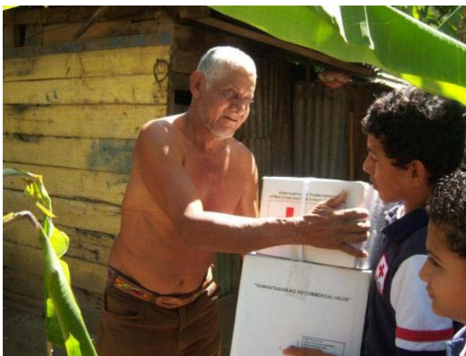
An elderly member of the Bebedero community, in the Bagaces canton, received relief items after being affected by floods.

Similarly to other countries in Central America, on the second week of October 2011, Costa Rica was affected by intense rainfall brought by Tropical Depression 12-E (TD 12-E). The affectation brought by the systems, directly impacted some 46,695 persons and 9,339 were evacuated to safer areas or took refuge in 33 collective centres. In Guanacaste, the most affected province, many of the rivers and streams flooded and 2,456 wells were contaminated, increasing the health risks of the population as some 12,280 inhabitants were left with contaminated drinking water.