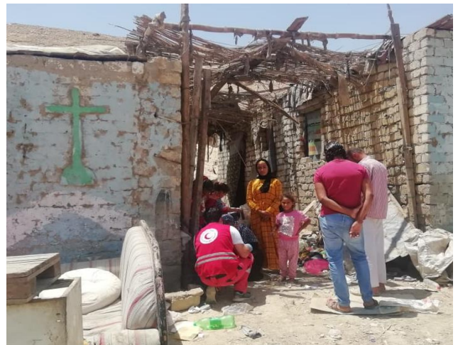
Figure 9. ERC volunteers conducting questionnaires.

One of ERC staff members was infected with COVID-19 on Tuesday 19 May 2020, which led to ERC taking the precautionary procedures by closing the office starting Wednesday (20 May 2020). Therefore, all activities of the DREF were postponed from Wednesday, 20 May 2020 till Sunday 31 May 2020.