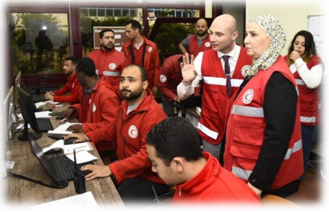
Figure 5. Minister of Social Solidarity and ERC CEO in the EOC during the operation.