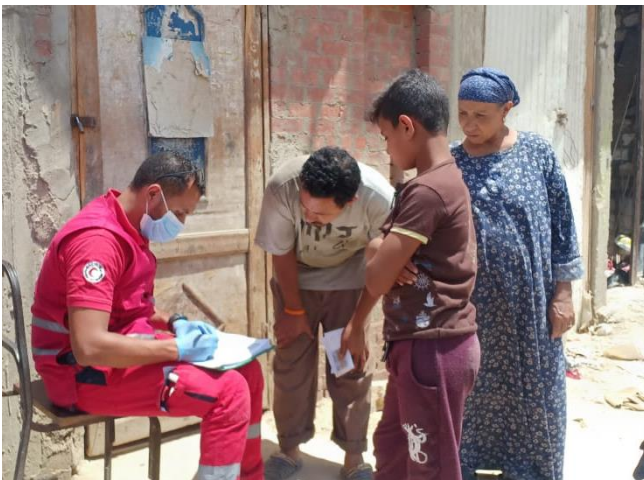
Figure 8. ERC volunteers conducting questionnaires.

Because of COVID-19 in Egypt, the Egyptian Government has been issued obligatory precautionary measures that every entity in Egypt has to follow it. These measures include, reducing the number of employees, reducing the number of working hours and applying a curfew in the country. The Egyptian government issued a decree stating that all activities will be closed throughout the day from Saturday 23 May to Friday 29 May 2020.