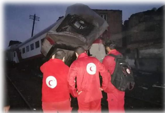
Figure 1. ERC team conducting rapid assessments.

On 11 March 2020, the Egyptian Red Crescent (ERC) issued an emergency alert and activated its Central Emergency Operations Center (EOC) as well as the Emergency Operations Rooms at the Branches.