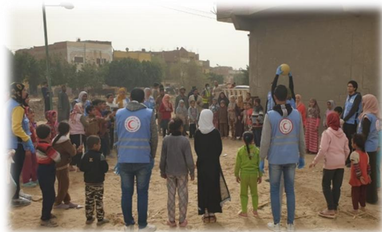
Figure 2. ERC volunteers providing PSS to children affected by the floods.

Following the floods, the government declared a state of emergency alert and ERC activated its Emergency Operations Center (EOC) which has remained operational since the floods. The ERC has been responding to the emergency with 100 ERTs in 27 branches activated and an average of 500 volunteers mobilized throughout three days.