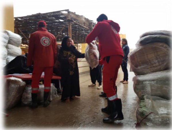
Figure 3. Distribution of relief items following the floods.

The National Society has undertaken the following since the onset of the disaster: