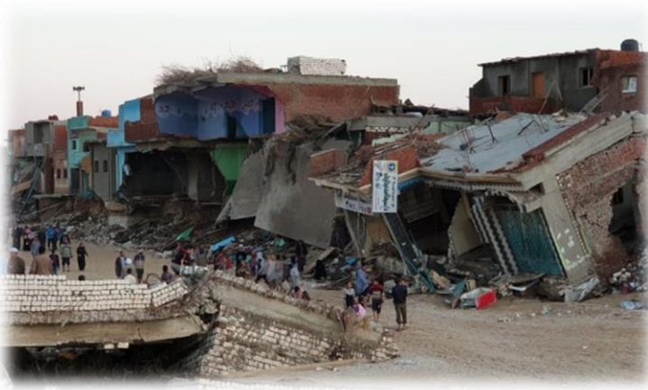
Figure 4. Damage of infrastructure from the floods.