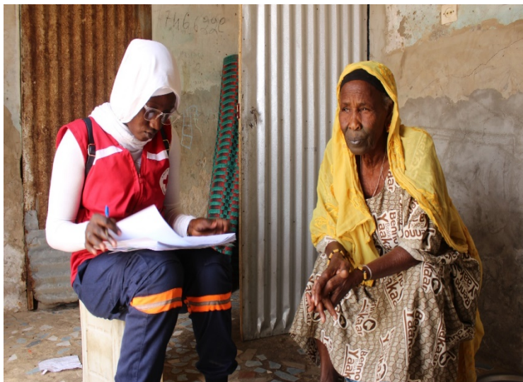
A Senegalese Red Cross volunteer registering a woman head of household