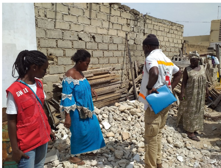
The Senegalese Red Cross volunteers conducting a rapid assessment

The Senegalese Red Cross Society (SRCS), in collaboration with local authorities, conducted a rapid assessment on 17 September which revealed that 991 households or 8,919 people were affected and were in a precarious situation. Additionally, six deaths were reported of which four were caused by lightning, and two from drowning. The most affected people were women, children, the elderly, and people with disabilities who were sheltered in schools with limited access to essential services.