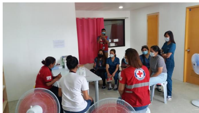
Philippine Red Cross Zamboanga Chapter officers conduct assessment with recent returnees from Sabah at the Zambo ECOZONE quarantine facility.

IFRC's support is required to fill service gaps to ensure all returnees have access to essential basic items and services and to provide first aid and psychosocial support to assist returnees in this transition. PRC chapters are undertaking assessment activities to ensure PRC service provision is complementary to government and other contributing actors' inputs and to avoid any duplication of supplies and services.