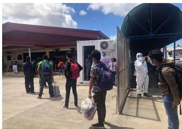
On 5 July 2020, returning Filipinos arrived in Zamboanga City from Sabah, Malaysia. These returnees will then be assisted by the local government until they reach their respective hometown.

Many of the returnees have resided in Sabah for many years and had established lives and families in Malaysia. Some of the returnees no longer speak the language/s of Mindanao. A driver for migration from Mindanao is perception of better livelihood