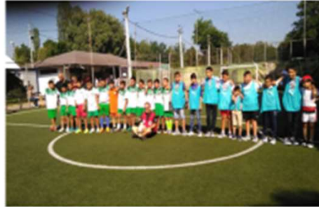
Cross-cultural soccer matches