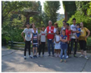
Cross-cultural children's activities