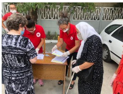
Bank cheque distribution by ARC staff and volunteers.

Hotline services (toll free number) were also established in the Headquarter of ARC. More than 250 phone calls were received and HHs communicated their satisfaction as well as posing questions or asking for information. Some of the HHs also asked why they were not selected for the cash support. In these cases, ARC has provided an appropriate explanation and described the HH selection criteria as needed. ARC has employed a full-time dedicated staff for the hotline service.