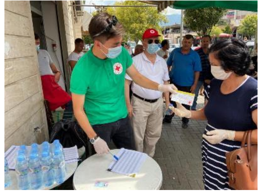
Bank cheque distribution by ARC staff and volunteers.

The first round of distribution took place from the 9 to 30 June 2020. The second round of distribution was completed at the end of July and third round of distribution was completed on 31 August. A total of CHF 1.2 million was distributed in the three tranches.