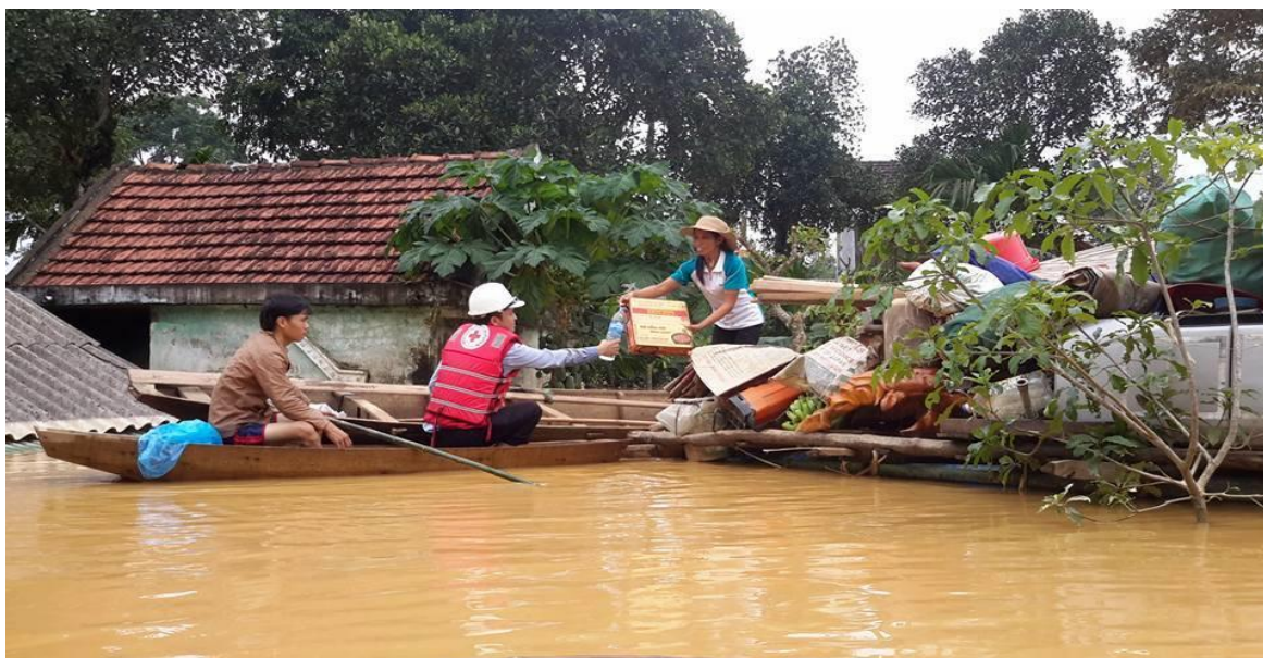
VNRC Quang Tri Chapter distributes instant noodle and water to affected people.