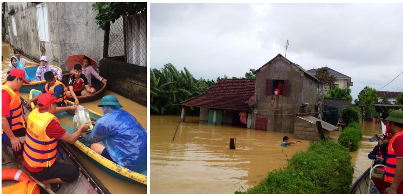
Provincial Disaster Response Team in Quang Binh provided prompt support to affected people in flooded areas (instruction of using water purification tablets and distribution of household kits.