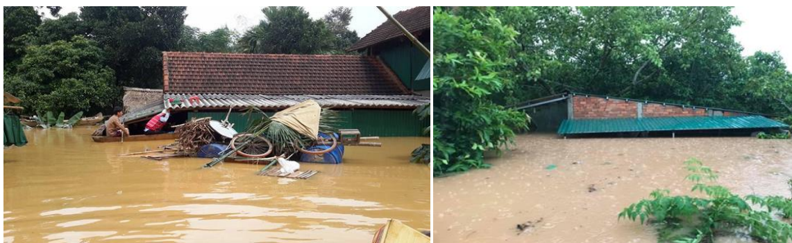
Floods affected houses in Quang Tri province

Close to a million people have been severely affected by flooding in central Vietnam. At least 55 people lives have been lost due to the floods. Hundreds of thousands of people have been cut off by the floodwater and are now in desperate needs of emergency relief, such as emergency shelter, safe drinking water, food and livelihood income support.