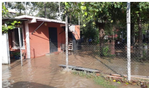
Image 1- Flooded house in Batumi; October 2020.

Since July 2020, 118 volunteers were mobilized and engaged in the local response activities, including information collection, situation assessment and distribution of food and hygiene items to 3390 individuals (1,005 HH) in the targeted communities of Oni, Lanchkhuti, Kutaisi, Lagodekhi, Lentekhi, Sagarejo and Batumi municipalities. Promptly after the October 2020 floods, the Batumi branch, in coordination with the GRCS HQ office, engaged the mobilized volunteers in the emergency response action involving the data collection and situation assessment in Batumi municipality.