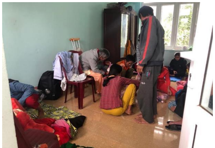
150 people was staying in the Commune PC Office in Tan Ninh commune, Quang Ninh, Quang Binh since 18 October 2020.

According to the JAT report, there are findings related to safety and security in evacuation sites. For example, thousands of people had to evacuate to safe places for three to 14 days (Hue: 15,147 households; Quang Binh: 29,793 households and Quang Tri: 15,372 households). Evacuation sites are often in public places (community houses or commune people's committee offices) or neighbour's houses. These locations often do not have dedicated sleeping areas separated by gender. They often become overcrowded with both family and non-relatives which limits privacy and can lead to conflict between families, general harassment and intimidation, increased risk of violence and sexual harassment to women and girls and boys. In many cases affected families have no electricity, no flashlights and mobile phones were out of battery. Women - especially single or widowed women - do not feel comfortable/safe to stay in these places. Some of them tried to go back to their houses as soon as they could, even their houses are still inundated. Evacuation sites are not accessible for people with disabilities. They do not provide facilities for basic health services and sanitation for evacuated people. Many have no bathrooms and toilets at all, or no separate bathrooms and toilets in the evacuation sites.