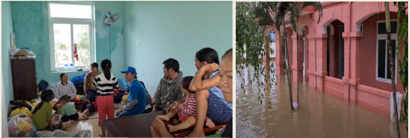
Living in evacuation centre - Tân Ninh Commune People Committee Office, Quảng Ninh District, Quang Binh Province.

Furthermore, heavy floods affecting/contaminating many water-wells and water sources, there is a high need of household water containers in the community.