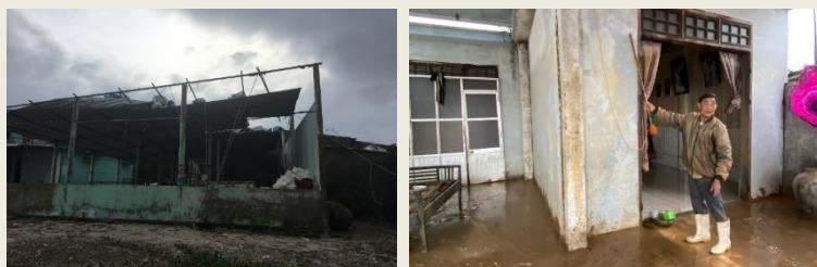
Damaged and flooded houses in Quang Binh province.

In addition, 400 households will be fully supported with newly built houses (flood resistant houses) and 650 affected households will be provided with conditional cash (voucher for materials) for repairing damaged houses. The repair and construction work will be implemented within nine months with strict guidelines and monitoring from VNRC and technical partners. Trainings will be provided for local government agencies and households on safe shelter and how to reinforce houses before natural disasters together with distribution of IEC materials. The disbursement of cash support to affected households will be done through financial service providers (FSPs).