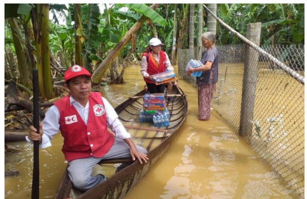
VNRC in Quang Tri province provides water and food to the affected people.

Apart from the government, the VNRC has been among the very first to respond to this flood situation and continues to be one of the leading actors working in the affected provinces. Thousands of volunteers and staff from local chapters participate in the evacuation efforts of affected people to safer places. The evacuation process is well coordinated with local authorities and further enhance the preparedness of the community in response to the disaster. These teams were also actively involved in needs assessments and relief distribution.