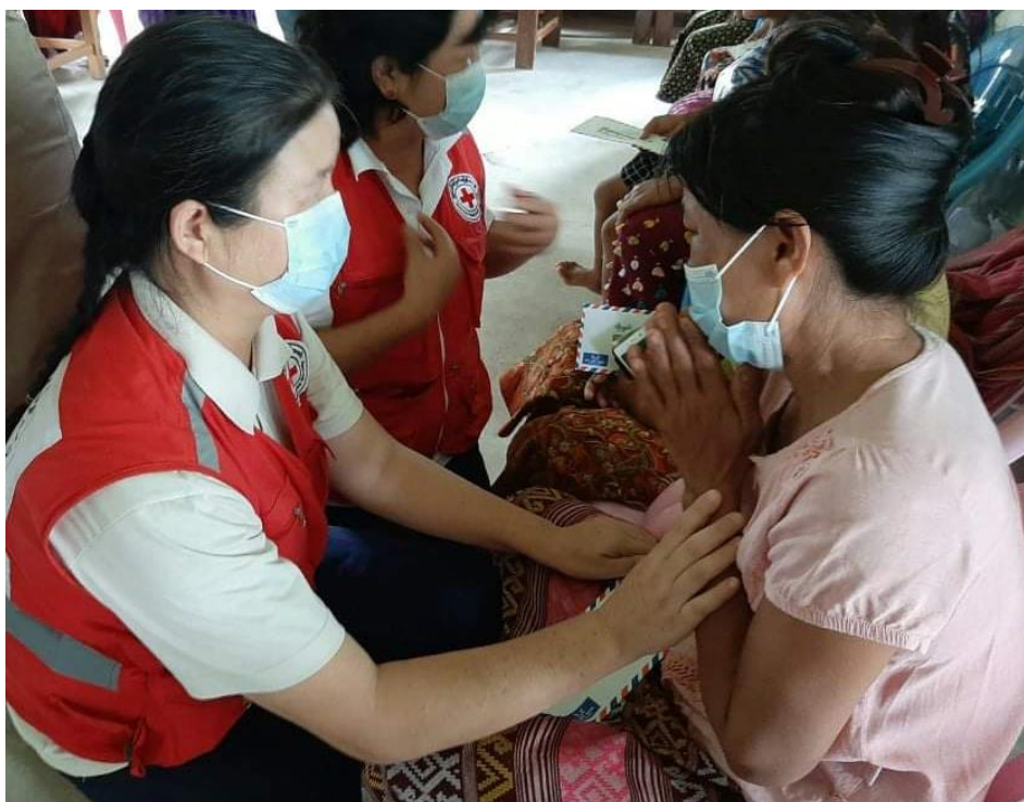
Psychosocial support session with individuals and families affected