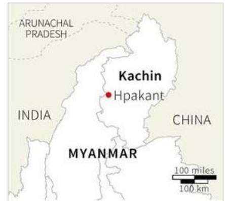
Hpakant, Kachin – affected area of the jade mine collapse.

Financial support through the Disaster Relief Emergency Fund (DREF) was provided to MRCS to support search and rescue (SAR) efforts, First Aid (FA), psychosocial support (PSS) to the affected people and their families, provision of PSS for RCVs involved in SAR and socioeconomic support to affected families.