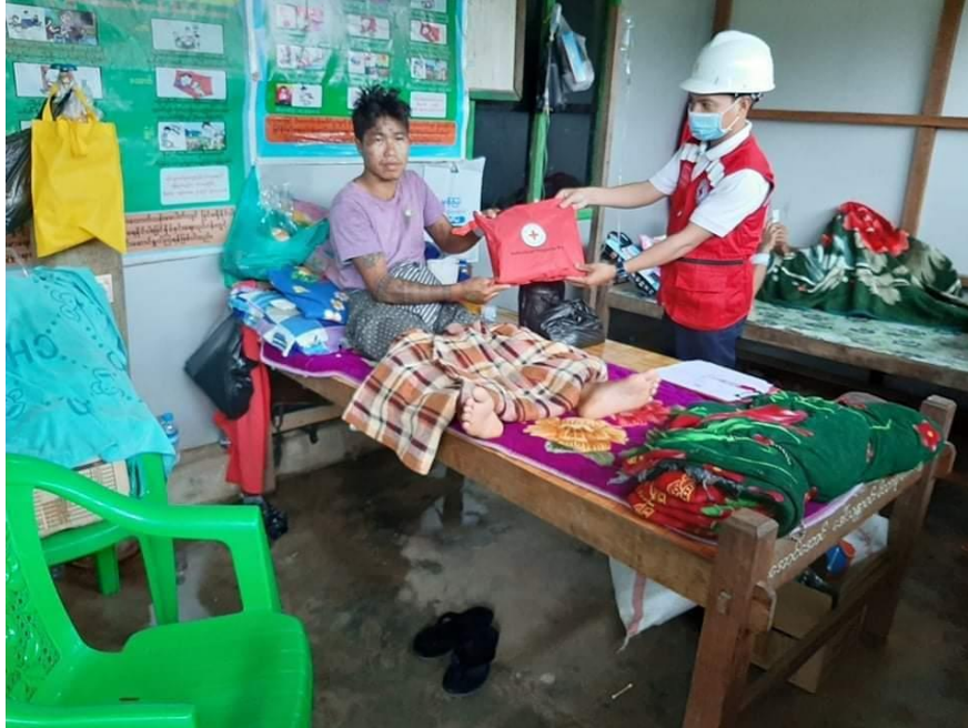
Distribution of personal hygiene kit.