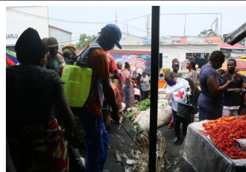
Sanitation session in Kinshasa.

During the lessons learned workshop organized at the end of the operation, the beneficiaries expressed their satisfaction and acknowledged the fact that they had been properly briefed on how to use the distributed items.