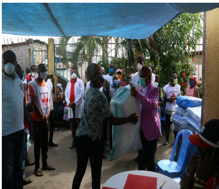
Distribution of NFIs in Kinshasa.

From October to November 2019, torrential rains caused serious flooding in seven provinces of the Democratic Republic of the Congo (DRC), including Nord-Ubangi, Sud-Ubangi, Mongala, Bas-Uele, Haut-Uele, Maniema, Sud-Kivu, Kasai, Kinshasa and Tshopo, with Nord-Ubangi, Sud-Ubangi, Mongala and Kinshasa provinces being the most affected provinces. The IFRC tried to mobilize international support to respond to the floods and secured funding from USAID for the response in Nord Ubangi province, and DREF funds for the response in Kinshasa through this DREF operation. The situation described in this report relates exclusively to the intervention in Kinshasa with DREF funds. Another reporting line exists for the response in Nord Ubangi.