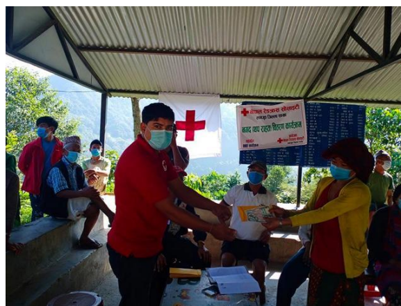
A glimpse of unconditional cash support to most affected family in Lamjung district.

NRCS Achham, Baglung, Bajura, Darchula, Dhading Lamjung, Myagdi, Sankhuwasabha and Sindhupalchok district chapter had conducted quick market and financial service provider (FSP) survey before distributing the cash. NRCS operation team in coordination with cash working