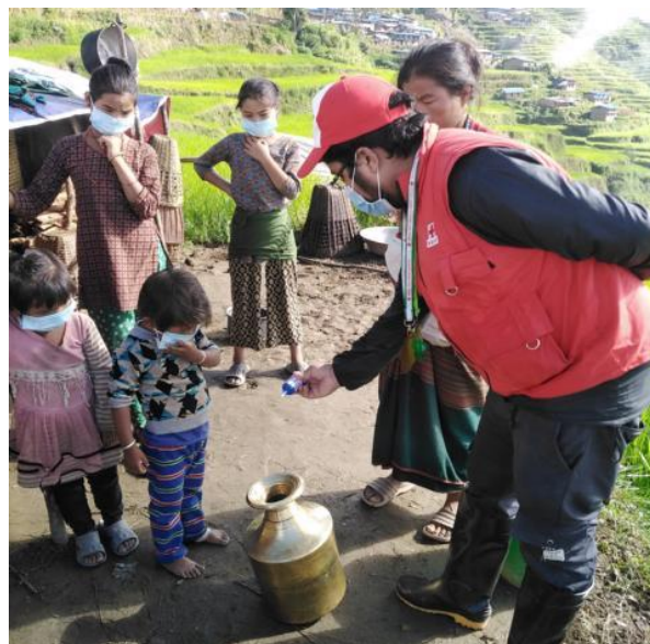
Demonstration of water purification by NRCS volunteer.

NRCS Sindhupalchok district installed two water tanks in the temporary camp set up in Jugal rural municipality and maintain/repair three water supply system at Barabeshe and Jugal Camp in October 2020. Due to which, a total of 725 people (approximately 370 women and 355 men) have easy access to safe drinking water.