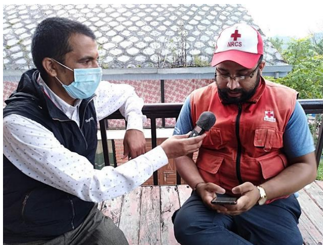
Staff from Communication Department collecting information about DREF Operation at Sindhupalchok.

Altogether, 60 Initial Rapid Assessment (IRA) compiled reports received from affected districts which was collected through a three-member team including NRCS, the Local Government and Nepal Police. On the basis of the IRA reports and the information provided by affected District Chapters, NRCS response activities are going on in affected areas.