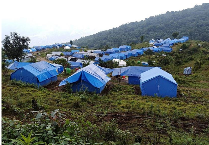
Temporary shelter in Sindhupalchok district.

NRCS NHQ have dispatched 3,757 sets of full household items package, 2,575 sheets of tarpaulins, 300 sets of utensil sets, 620 pairs of blankets and 1,400 units of buckets to district chapters since mid-July 2020. However, the distribution of shelter and household items are ongoing. So far, NHQ has received distribution report of the items from its' district chapters which includes total of 7,249 families from 40 affected districts reached with 2,143 full sets of household items package, 5,106 sheets of tarpaulins and 104 units of family tents. Out of 7,249 families, 5,000 families have been reached through the DREF and the remaining families were reached through the NRCS internal support. Similarly, NRCS also distributed 306 utensil sets and 1,258 pairs of blankets to the affected families. Similarly, up to reporting period, altogether 7,249 households received orientation and technical guidance in shelter support.