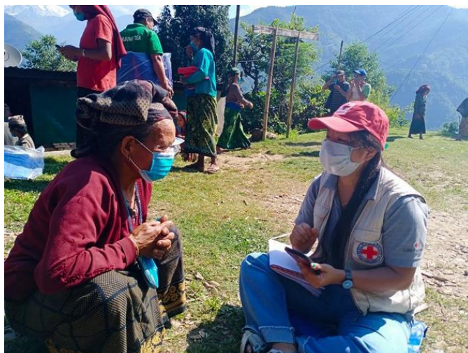
A glimpse of exit survey being conducted in Lamjung district after the distribution of the unconditional cash grant in October 2020.

Kalikot, Gulmi, Darchula, Bajura, Sindhupalchok, Myagdi, Jajarkot, Dhading, Shankhuwasabha, Baglung, Kailali, Achham, Lamjung and Dolakha district chapter have started to collect SADD data which was sent to NRCS HQs with detailed assessment. NRCS HQs organized a virtual orientation on 5W reporting template for DREF focal person on 15 October 2020 with the participation of 20 NRCS volunteers. As of October 2020, out of 14, five District Chapters have submitted the data and information in the 5W template and NHQ is following up with the remaining District Chapters to share the 5W data including SADD in the 5W template.