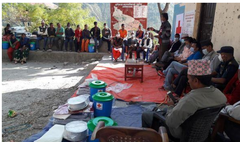
One of the emergency distribution centres at Budinanda Municipality of Bajura district.

NRCS is actively participating in different sectoral level (WASH cluster, Shelter cluster, Protection cluster, logistic cluster, Cash coordination group meeting) cluster meetings at central level as well as provincial level. In the centre level WASH Cluster meeting is led by UNICEF Nepal. Protection cluster meeting is led by Ministry of Women, Children and Senior Citizen and co-led by UNFPA. UNRCO has been conducting inter-cluster operational meetings in weekly basis and IFRC and NRCS has been attending these meeting in regular basis. Likewise, IFRC/NRCS has been coordinating shelter cluster meeting during this period and 4 events of shelter cluster meeting have been conducted during this period.