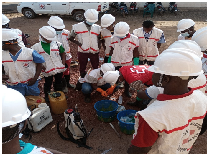
Figure 1: Training of volunteers on hygiene and sanitation activities.