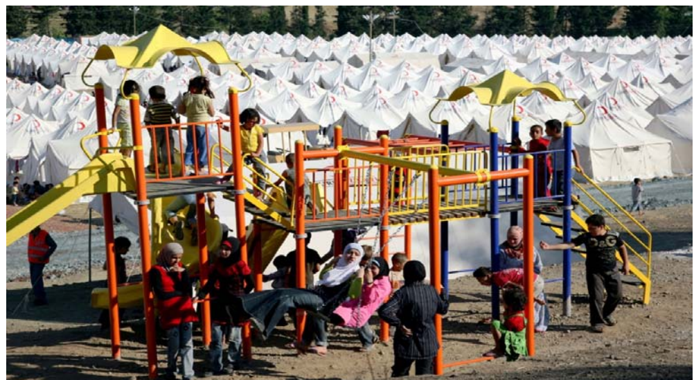
As of the reporting date; 12,681 Syrian citizens have been hosted in 5 camps located in Hatay.

Government of Turkey (Ministry of Foreign Affairs/Disaster and Emergency Management Presidency - AFAD) reported that the total number of Syrians accommodated in 14 camps, in seven provinces increased to 137,756 persons including those undertaking medical treatment in hospitals and their companions (665 persons) on December 11, 2012. According to the United Nations Country Team in Turkey, the estimated number of Syrian citizens living in urban areas is increased to approximately 60-70 thousand.