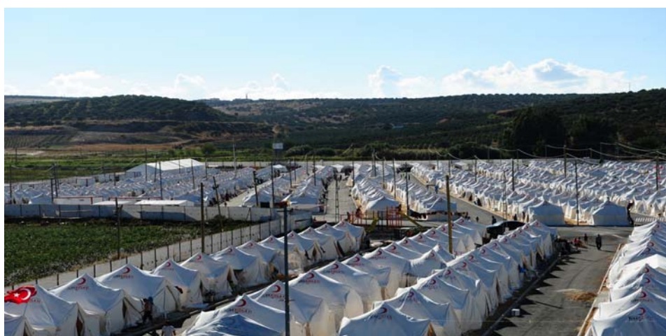
Akçakale Tent Camp hosting more than 20,000 Syrian citizens.

Contributions are urgently needed to enable the Turkish Red Crescent to meet the immediate needs of the most vulnerable.