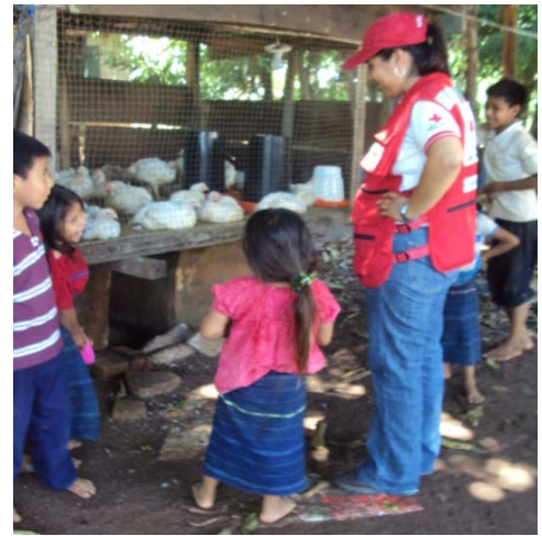
Children show a Red Cross volunteer the poultry project that was supported by the Emergency Appeal to assist affected families with lost livelihoods.

Once the plans were developed with the communities, the field managers shared them with National Society's headquarters for review and approval. Once the final strategy was established, the GRC consulted with the Ministry of Agriculture and Livestock (Ministerio de Agricultura y Ganadería, MAGA) and other organizations for technical assistance in selecting seeds that would be suitable for the soil in the areas, altitude and climatological conditions. Once the seeds and other needed materials were selected, the Procurement Unit of the National Society supported the regional branches in the purchasing process to ensure that different local companies participated.