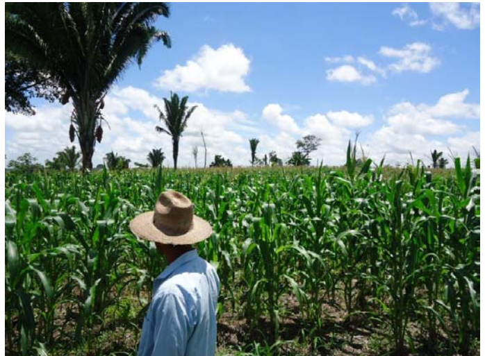
A beneficiary from Cobán department shows the progress of the family's corn fields that were recovered with the support of the Guatemalan Red Cross and the Emergency Appeal.

Summary: Tropical Depression 12-E severely affected all countries in Central America in October 2011. Its intense rains caused flooding and landslides in Guatemala and affected more than 500,000 persons, of which 82,913 were severely affected. Given the situation, the Guatemalan government decreed a State of Public Calamity on 16 October, and the National Society developed a Plan of Action to assist some 7,500 beneficiaries (1,500 families).