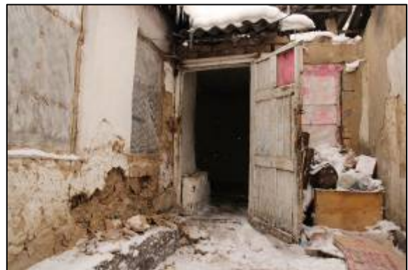
Households without energy sources in the Bishkek city.

Due to power cuts, a number of households without access to electricity at one moment differs greatly from hundreds to thousands. There are power and gas cuts every day across the whole country, including Bishkek. Failure of energy sources affecting people's living conditions and livelihoods.