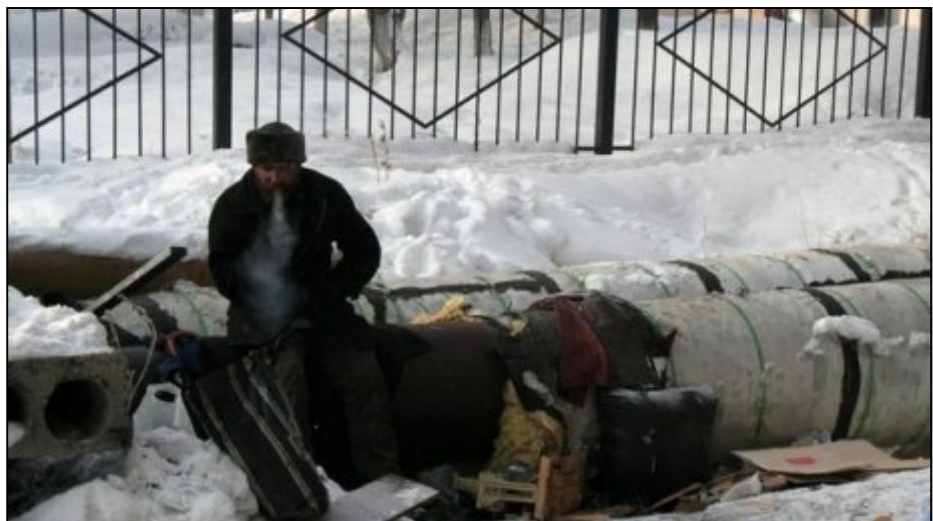
Eastern Kazakhstan: Homeless exposed to the severe cold

Summary: Freezing temperatures reaching minus 40 to 46 degrees Celsius have been hitting the northern, eastern and