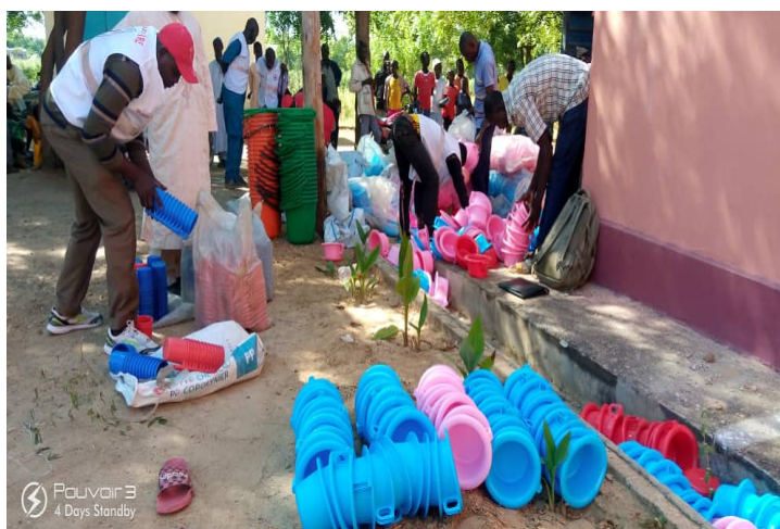
Preparation to the distribution of Wash kits in Moulvoudaye-Mayo Kani

The mapping of boreholes and latrines was conducted and allowed the CRC to determine what material is procured to rehabilitate 50 latrines and the number of water points that can be realistically be rehabilitated with the available budget for this activity. The repairs will start in January 2021.