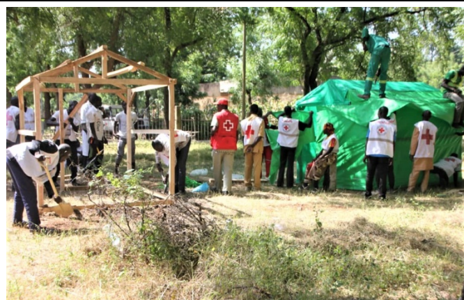
Shelter training in Kaele in October 2020

Volunteers were then deployed for three days to support communities in building their own shelters, however some delays were faced because during this season, communities spend a lot of time harvesting on the farms. To date, the completion rate of shelter construction is 87.5% in Mayo-Kani and 88.7% in Mayo-Danay.