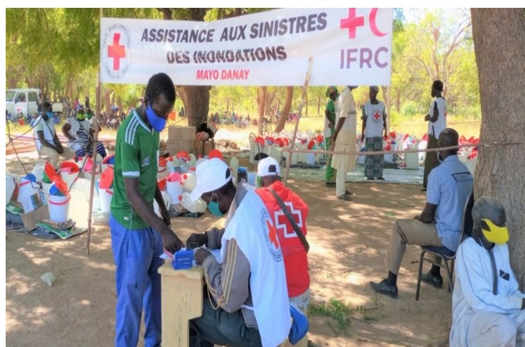
Beneficiary registration for distribution in Guere, Mayo-Danay