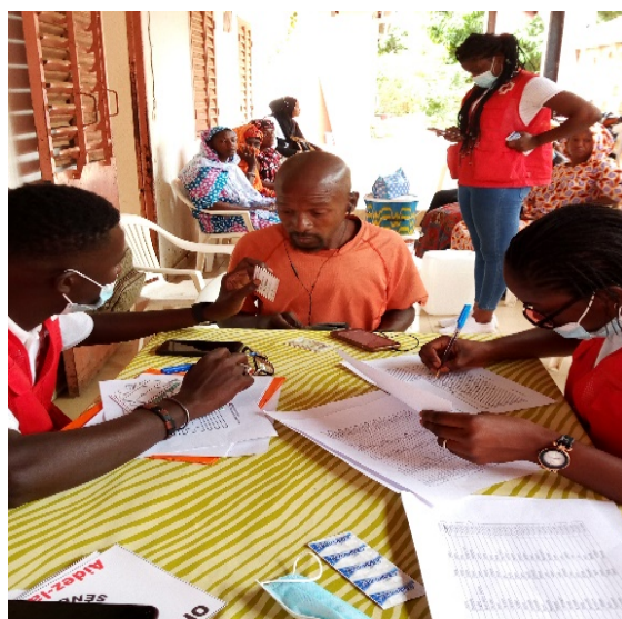
Registration of beneficiaries for the distribution of wash kits. Thiès, November 2020.

In the aftermath of the event, the SRCS activated its response system, mobilizing Community Disaster Response Team' (CDRT) volunteers at community level, who coordinated initial life-saving activities with local authorities. Countrywide, a total of 2,600 volunteers were mobilised in the flood response . In Dakar and Thiès regions, a total of 460 volunteers were engaged in the initial assessment, allowing the identification of needs and facilitating the coordination with other stakeholders.