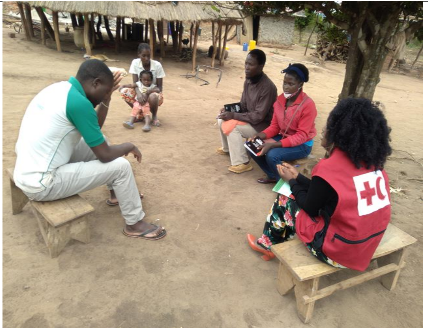
PGI Team sensitizes a family in Macate, in Manica Province, on GBV related themes