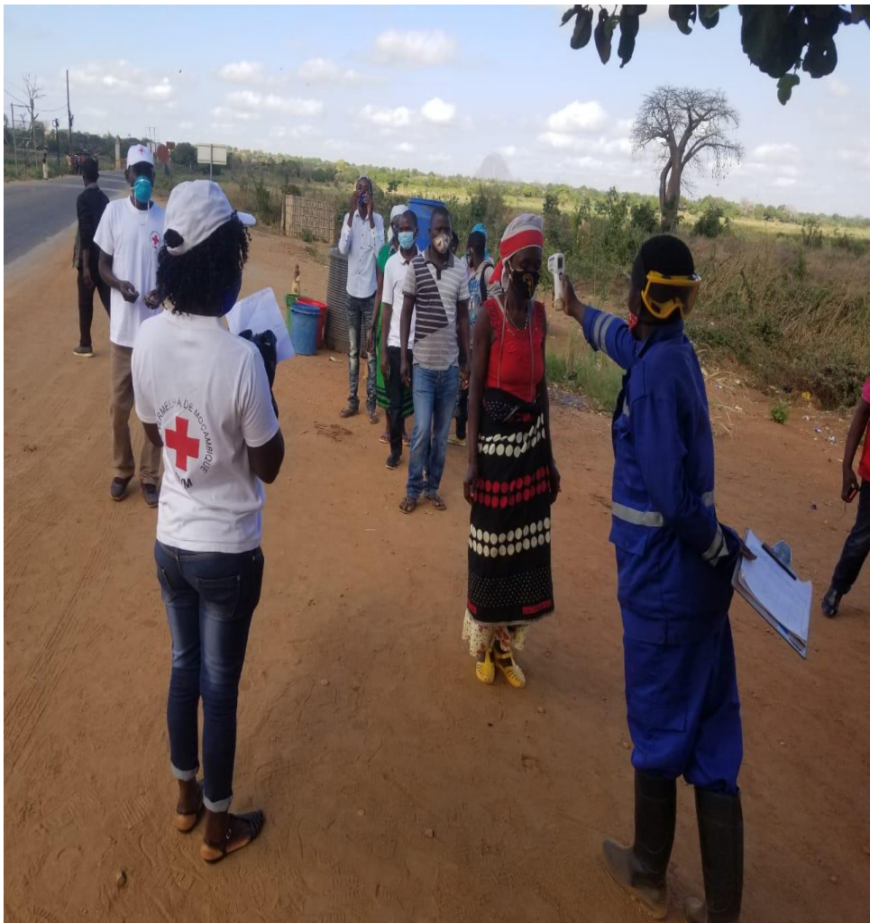
CVM Volunteers engaged in RCCE activities

CVM has defined a phased approach to COVID-19, aligned with the operational context at every given moment of the epidemic's evolution. The first phase (preparedness) involved the definition of a Business Continuity Plan, support to the Ministry of Health in designing and disseminating relevant COVID-19 information to the public through Information, Education and Communication (IEC), Radio and TV broadcasts, including health prevention, PSS and rumors/misinformation management and training its own staff in prevention and risk reduction. In this phase, CVM volunteers countrywide received an accelerated training on Epidemic Control for Volunteers (ECV), and Risk Communication and Community Engagement (RCCE) specifically related to COVID-19. In the second phase – wide response – over 2000 volunteers will continue RCCE activities through mass dissemination of prevention and transmission risk reduction information in their communities and increasing people's access to hygiene in critical points, such as transport hubs, markets, etc., by installing handwashing points in the communities. In the third phase – heightened response – the national society will focus on reduced areas, where transmission risk is higher, and its activities will be more specialized, such as community-based surveillance, contact tracing and community case management alongside the Ministry of Health. At this point, these services will be complemented with psychological first aid to staff and volunteers.