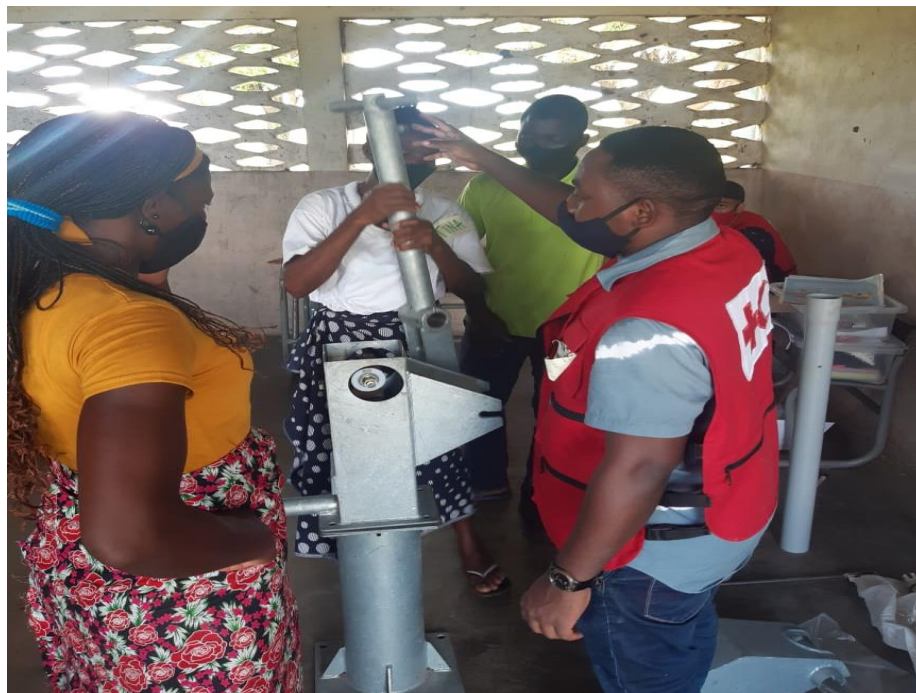
Training to water committee on water-pump repair, Katsanha, Tete

Dondo District: (Mandruzi (1)and Nhamaiabwe(1), Mutua/Chissange (4), Dondo-Sede (5), in collaboration with local CVM and SDPI of Dondo