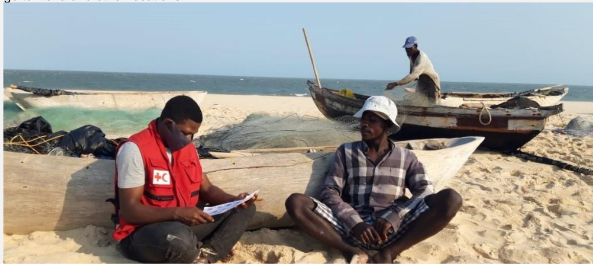
PDM for Fisherfolks, Praia nova, Dondo district

A PDM was conducted for the 148 fishermen that were assisted with fishing materials. The PDM, of which data is currently being analysed was carried out with a sample of 59 fishermen. Pre-analysis of the collected data shows that 75% of the fisherfolks are becoming financially independent as they are able to save money in the loan and savings group. One of the groups composed by 20 fishermen is reported to have saved about 14,000mts and will keep increasing. Most of the fish and seafood is sold to resellers who constantly go to Beira and other locations.