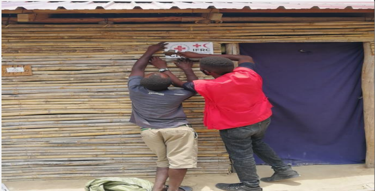
Shelter built with Community participation using BBS techniques. Chinamacondo

In order to guarantee a reliable supply of construction materials, the IFRC together with CVM work with LevasFlor, a Swedish owned Mozambican FSC certified company with a 46000-hectare of natural forest concession. The company replant trees making it eco-friendly and provides a sustainable supply.