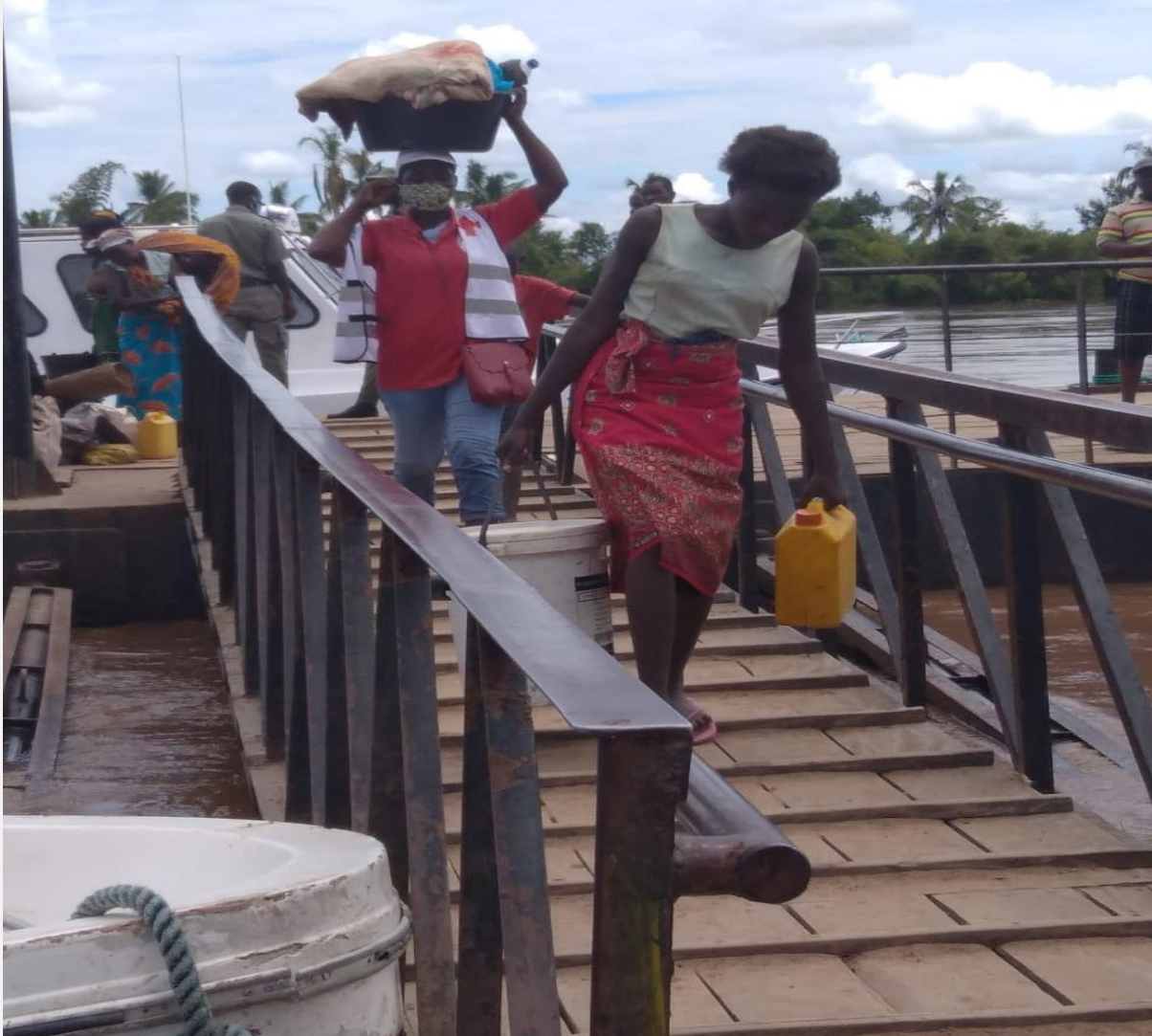
A volunteers is supporting IDP families affected by Tropical Storm Chalane

Volunteers are also at the heart of the COVID-19 community response. Over 400 volunteers have been trained on Epidemic Control for Volunteers (ECV), RCCE and PSS, to start community prevention and sensitization activities across the country. Especially important is the element of duty of care for volunteers, hence attention was given to ensure they have protective equipment and understand how to use them properly, as well as the necessary information to deliver activities in a safe manner. To note, activities were also adapted to respect social distancing, avoid gatherings, and be able to access hygiene items regularly