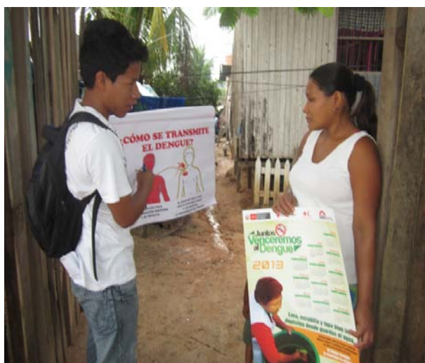
Peruvian Red Cross volunteers carry out awareness raising campaigns in the Manantay District (Ucayali).

According to the Peruvian Red Cross, 96.5 per cent of cases were reported in the peri-urban districts of Calleria, Yarinacocha and Manantay in the central province of Coronel Portillo in Ucayali department. On 8 November, the regional health director declared an emergency in these districts and the regional