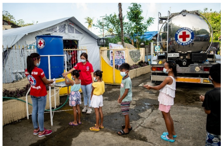
Volunteers providing step by step guidance on hand washing to children.

The last report of National Disaster Risk Reduction and Management Council (NDRRMC) Sitrep #12 as of 11 November 2020 and Department of Social Welfare and Development - Disaster Response Operations Monitoring and Information Center- (DSWD - DROMIC) report #36 as of 18 December 2020 are summarized below: