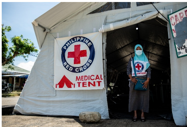
Medical tent set-up which is used as an Extension Emergency Room/Triage (Photo: PRC).

PRC mobilized one ambulance in the Legazpi city in Albay Province to support transportation of injured people to medical facilities. Furthermore, PRC mobilized its staff, volunteers, and assets to provide first aid support and search and rescue operations. A total of 3,292 individuals were provided with first aid and blood pressure measurement, and 4,567 individuals were assisted through basic health care consultations. Furthermore, as part of search and rescue support, 366 individuals were rescued and transported.