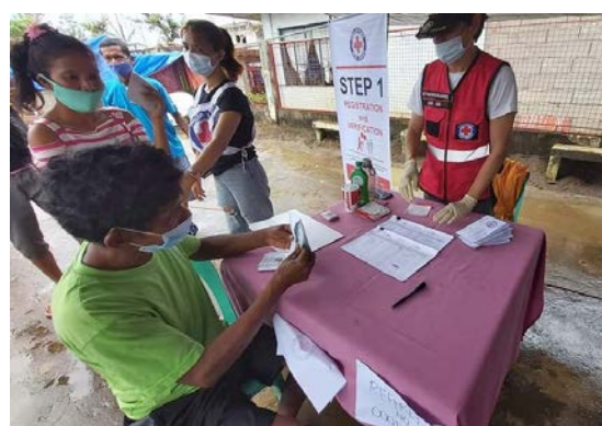
Distribution of multipurpose cash.