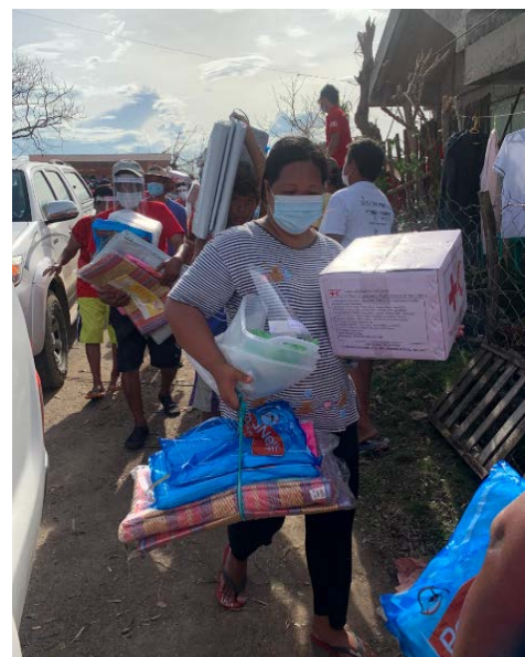
Person received a NFI standard kit including a hygiene kit.