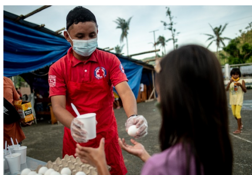
Providing hot meals to affected people (Photo: IFRC).