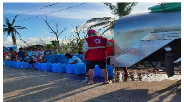
Water distribution to people 15L to each family.

PRC mobilized its RC143 WASH volunteers to support the operating of the water treatment unit. These volunteers monitored the use of water at the household level, conducted water quality testing, and conducted sessions on water storage, treatment, and utilization.