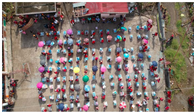
NFI distribution site arranged according to COVID-19 regulations (Photo: PRC).

To-date a total of 415 families were supported with ESA. Each family is provided with 10 CGI sheets, 1 plain sheet, and tools (common wire nails and umbrella nails). ESA will enable families to fix their roofs immediately. The CGI sheets will be used for roofing, the plain sheet will be used for the ridge capping and the nails will be used for fixing. People that received said assistance were also provided with a safe shelter awareness session to ensure proper installation of CGI and other materials. Phase-II to be started from mid-February.