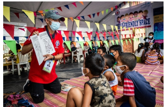
PRC volunteer providing learning support to children in a child friendly space.

Part of the volunteer and staff recruitment process is to sign a document that they have read, understood, and would abide by the PRC code of conduct. PRC establish child friendly and has reached 4,567 children. This assistance is provided via PRC bi-lateral funding raised. Through PRC's welfare services, traumatized individuals receive psychosocial support. Psychosocial support helps individuals cope with fear and anxiety due to the trauma caused by the typhoon, especially for children.