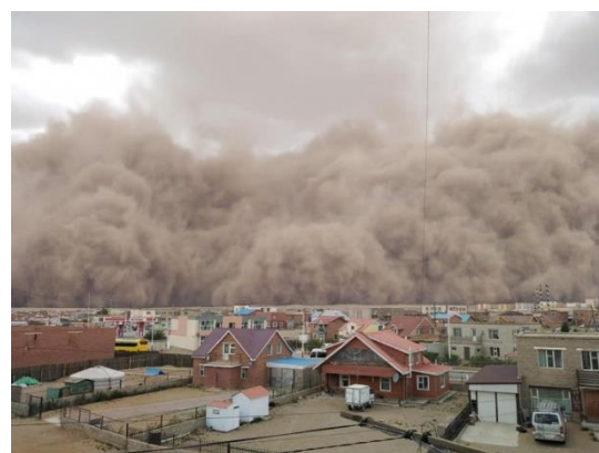
Houses in Dundgovi province before the wind.

According to the Mongolian Government Resolution No. 286 of 2015, should the wind speed reach 18 meters per second, it is considered as disaster while if the wind speed exceeds 24 meters per second, it is considered as the catastrophic phenomenon. This event is therefore considered as catastrophic.