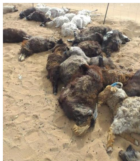
Livestock killed by the storm in Dundgovi province.

Families mentioned the preference for cash assistance as the modality for support in order for families to repair or rebuild their gers (traditional houses) and other types of houses. Even though there are 1.6 million livestock missing, it's still uncertain if all livestock are really perished or went stray due to the storm. It is known by the assessment team that no herder household had lost all their livestock, as identified in the needs assessment among the community, livestock loss was not considered to be a major issue.