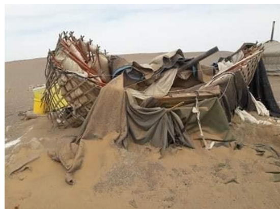
Ger is destroyed in Uvs province.