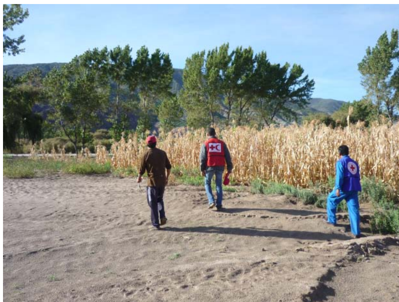
An assessments team of the Bolivian Red Cross was deployed to the affected areas alongside a Disaster Management delegate of the IFRC to determine current needs.

<click here for the DREF budget; here for contact details; here to view the map of the affected area>