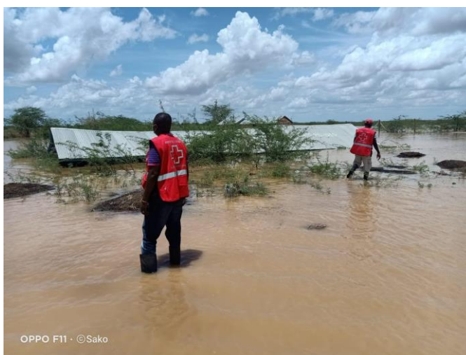
Photos of floods affected areas of Kisumu, Busia, Tana River and Marsabit Counties.