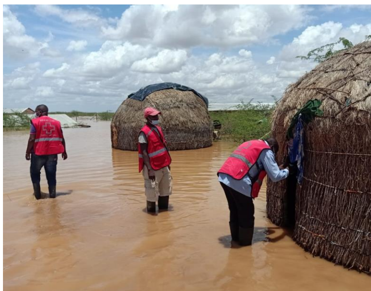
Kenya Red Cross Volunteers on assessment in the affected areas.

The KRCS deployed assessment teams in Tana River and Kisumu counties to help determine the extent of effects and identify priority needs for affected communities. The teams mapped out locations of displaced families as well as established routes to deliver required support. Findings from the assessments indicate shelter damage and some rendered inhabitable due to flooding, destruction of water and sanitation needs occasioned by scarcity in clean drinking water, as well as health needs for preventing disease outbreaks. The assessment also established disruption of livelihoods, due to significant submerging of land under cultivation. A total of 3,232 acres of land have so far been damaged.