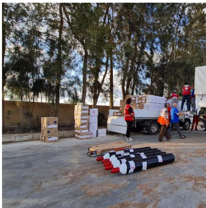
Figures 7,8: ERC volunteers delivering medical aid and emergency relief supplies to PRCS.