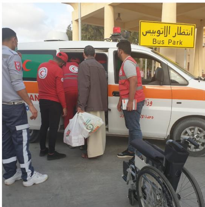
Figures 5,6: ERC volunteers assisting the Palestinian passengers at Rafah ground port.