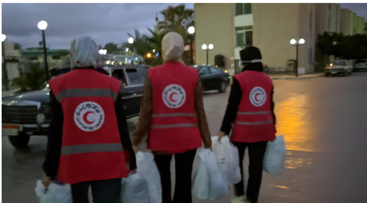
Figure 9: ERC volunteers on their way to the AL Arish hospital to deliver the personal and hygiene kits and to provide PSS to the injured and their families.