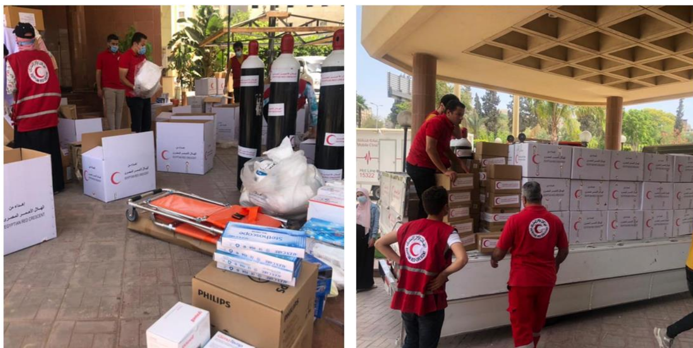
Figure 1 &2: ERC volunteers packing the medical supplies and emergency relief items to be delivered to PRCS.

From the first day of the escalation of hostilities in Gaza, the Egyptian Red Crescent (ERC) had raised its alert at the Central Emergency Operation Centre (CEOC) at the headquarter and activated its Emergency Operation Center in North Sinai Branch. ERC had launched a wide national donation campaign to receive all types of humanitarian assistance. ERC had mobilized its volunteers and staff to provide immediate humanitarian assistance, working in close coordination with the Egyptian authorities. The ERC has assisted in transporting more than 28 injured people to medical facilities and treatment in Egypt (last update 22 May 2021).