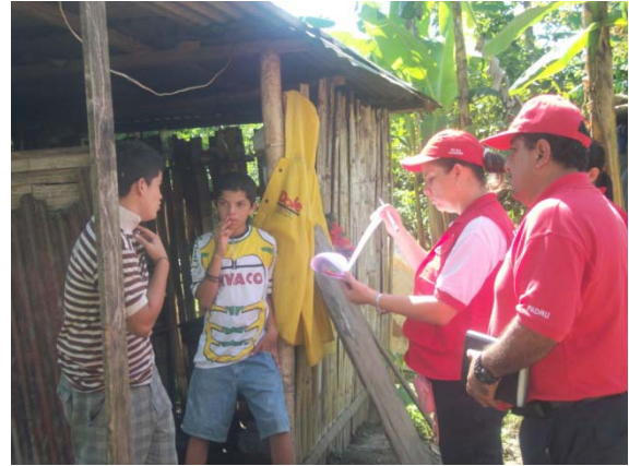
Volunteers of the Costa Rican Red Cross (CRRC) visited communities and homes to talk with the affected families to better understand the situation and needs of beneficiaries.

From the start of the emergency, the CRRC coordinated with other actors in their search, rescue, evacuation and pre-hospital treatment of affected people. Once, the first immediate response was concluded, volunteers visited families in the affected areas to converse with beneficiaries to better understand their specific needs. In this way, distribution during this operation was targeted based on the detailed reports gathered, with some families receiving diverse non-food items, while others were assisted only with the cleaning of their wells.