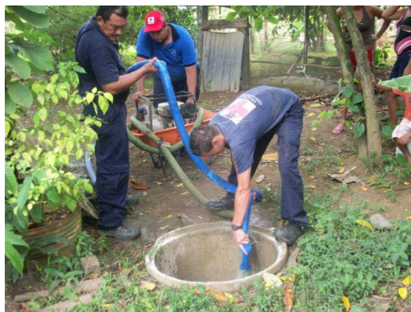
The Costa Rican Red Cross collaborated with governmental authorities to assist affected families with the cleaning of wells.

On the last week of July, a low-pressure system in the Caribbean brought severe precipitations to the Limón and Cartago provinces of Costa Rica. More than 9,500 persons were affected by the overflowing of rivers, particularly in the Talamanca municipality, and landslides in Turrialba. With the support of the DREF, the CRRC assisted 2,060 families with non-food relief items and access to drinking water through the cleaning of wells and hygiene promotion, significantly surpassing the original target of 750 families.