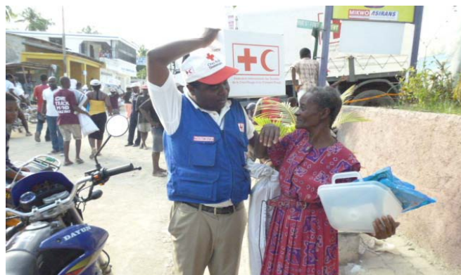
The Red Cross immediate relief assistance targeted the most vulnerable among the affected population.