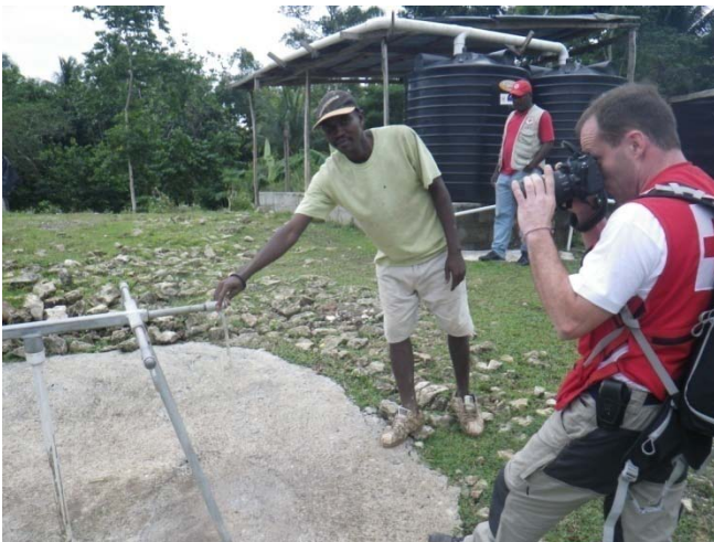
The FACT team carried out water and sanitation assessments in Grand'Anse.

Hurricane Sandy, which hit Haiti during the last week of October 2012, caused devastating impact in many parts of the country, particularly in the Ouest, Nippes, Sud, Grand'Anse and Sud-Est departments, as well as in the coastal areas of Artibonite and the North West part of country. According to the Haiti's Department of Civil Protection (DPC), Hurricane Sandy claimed 54 lives with 21 persons declared missing and 20 others injured. Around 20,000 persons were evacuated to 136 temporary shelters as a preventive measure. The Haitian Government's impact assessments indicated that 6,666 houses were destroyed, 24,348 were damaged and 9,352 were inundated. This was mainly in the Grand'Anse, Nippes, Sud, Ouest and Sud-Est departments. The heavy rains of 8 and 9 November 2012 in the North and Nippes worsened the situation with 14 reported deaths and damages to property including houses and crops. The impact of the disaster also caused outbreaks of cholera in the affected areas. The Government of Haiti declared a national state of emergency until the end of November 2012, which was later extended to 5 January 2013.