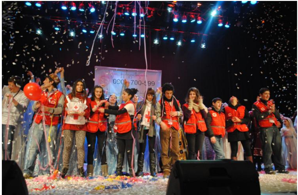
December 2012

Georgia Red Cross Society volunteers are fundraising to support patients with oncological disease