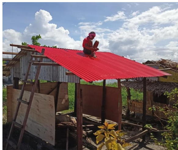
A household recipient in Sto Domingo, Camarines Sur installs the CGI sheets he received from the Red Cross.

Full Shelter Assistance (FSA) to those families whose homes were totally damaged by the typhoons is to be defined. This also gives provision for affected families to complement their shelters with additional facilities such as latrines and handwashing facilities. Both SRA and FSA are complemented with awareness raising or training on safe shelter awareness.