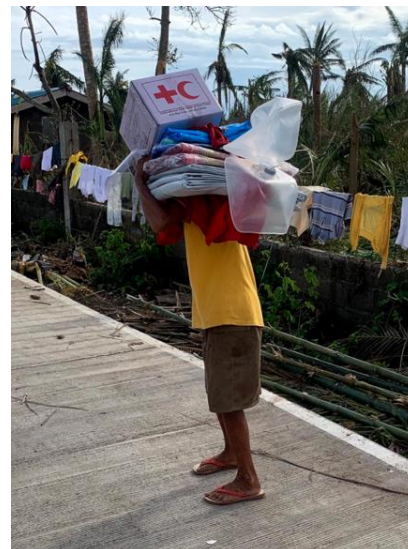
A recipient with an NFI standard kit including a hygiene kit.