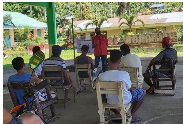
PRC and IFRC staff are doing safe shelter awareness session with carpenters and masons.

Furthermore, all carpenters and masons who have been and will be mobilized in the shelter programme are being oriented on eight key messages on safe shelter and build back safer techniques. As of reporting, 65 carpenters and masons from six communities where the shelter intervention are being implemented have been interviewed and selected.