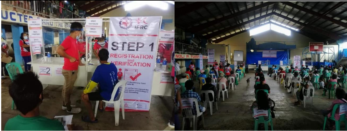
During the distribution of multipurpose cash grants, PRC ensured that health protocols are being followed. Alcohols and sanitizers are available in the distribution sites and all households' recipients were guided accordingly in the distribution process to ensure crowd control and to maintain social distancing.