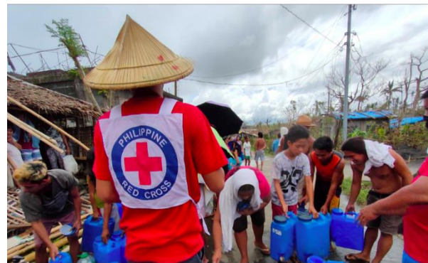
Water distribution to the affected people in Albay.

To meet the water needs, PRC deployed six water tankers and a bladder water filtration unit to distribute safe drinking water in areas of Catanduanes, Albay and Camarines Sur. A total of 4,226,822 litres of water has been treated and distributed by PRC. The actualised target mentioned above regarding water distribution is related to the unidentified contribution of water regarding the appeal and its reach. With the support of the IFRC, the PRC has distributed 12,000 litres of water and jerry cans (10L) to 4,300 affected families (see shelter section for details).