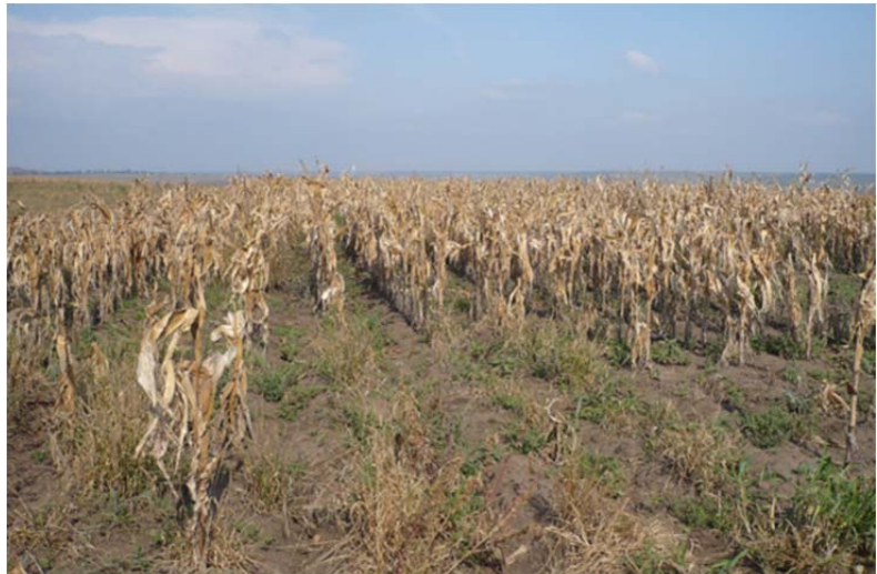
Maize field affected by the drought during the summer in 2012 in Moldova.

The main challenge that the country faced in 2012 was the combined impacts of poor rainfall and extremely high temperatures. The State Hydro-Meteo Service (SHS) reported that temperatures in June-July were 3.7-5.1 C° higher than annual averages and the number of days with maximum air temperature higher than 30 degrees was 39-62. (the norm is being