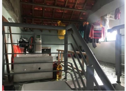
Attic floor built.

VNRC proposes to pilot 50 such structures. These designs were discussed with regional shelter and settlement coordinator and were approved from the technical point of view as more safe options. This change will increase the support to each household from VND 50 million (CHF 1,983) to 70 million VND (CHF 2,777).