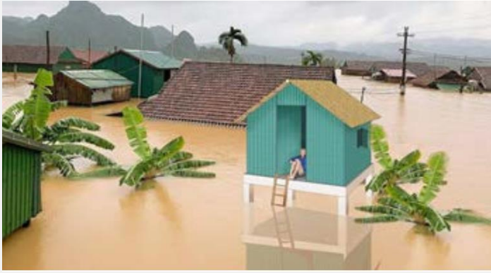
Sample design of flood resistant house in Central Vietnam.