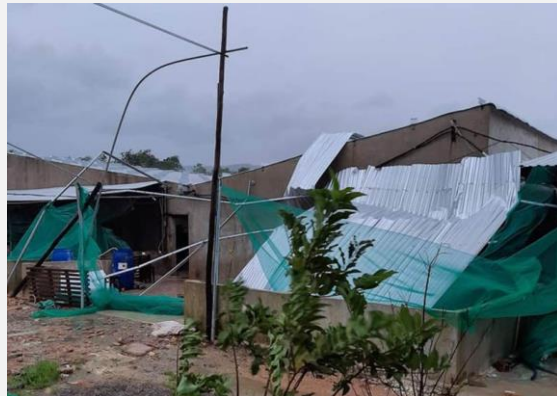
Damaged and flooded houses in Central Vietnam.

The assessments also showed that targets for shelter and other forms of assistance had to be revised to reflect the current needs on the ground. The needs have changed mainly because a number of households have carried out their own repairs and several actors (private and other I/NGOs) have come forward with assistance. VNRCs has also received multiple bi-lateral support which covered some parts of the needs assessed early after the disaster. Therefore, the shelter intervention under this Emergency Appeal was revised and reduced. The repair and construction work will be implemented within nine months since the EA launched with strict guidelines and monitoring from VNRC and technical partners. Trainings will be provided for local government agencies and households on safe shelter and how to reinforce houses before natural disasters together with distribution of IEC materials. The disbursement of cash support to affected households will be done through financial service providers (FSPs).