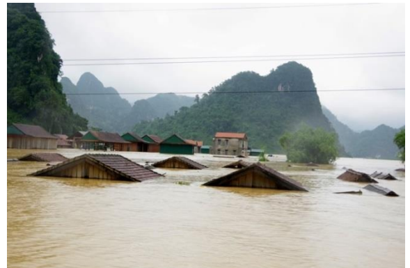
Many houses were submerged in Le Thuy, Quang Binh province.

The VNRC coordinates closely with government counterparts through the National Society's membership of the National Steering Committee on Natural Disaster Prevention and Control. At the branch level, the National Society has been active in assisting with the dissemination of early warnings and evacuations. The VNRC immediately released emergency aid, including cash assistance (CHF 120 bereavement grant per deceased household member) and household kits 1 from VNRC prepositioning stocks.