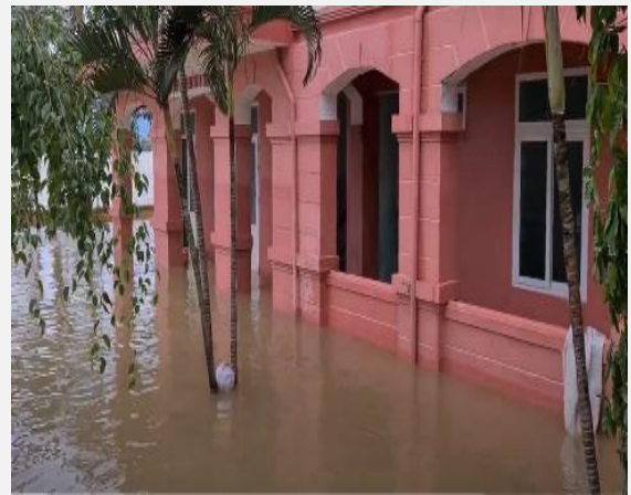
Living in evacuation centre - Tân Ninh Commune People Committee Office, Quảng Ninh District, Quang Binh Province.

Initial procurement plans of Aquatabs were changed, since Aquatabs are not available in the country and is very expensive to procure from overseas. Main focus will be given to awareness activities. Hygiene promotion activities were held alongside the distribution of water purification tablets, water supply through 39 events undertaken in the targeted areas. Awareness on hygienic practices will also be incorporated under school safety education under DRR.