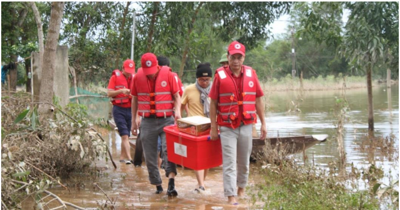
Viet Nam Red Cross staff carrying emergency relief materials to Thua Thien Hue, October 2020.

This revised Emergency Appeal seeks 2.3 million Swiss Francs , decreased from 3.9 million Swiss francs to enable the IFRC to support the Viet Nam Red Cross Society (VNRC) to deliver emergency assistance to and support the immediate and early recovery needs of 27,500 households (110,000 people) for 12 months , with a focus on the following areas and strategies of implementation: shelter, livelihoods and basic needs, health, water, sanitation and hygiene promotion (WASH), disaster risk reduction (DRR), community engagement and accountability (CEA) as well as protection, gender and inclusion (PGI). This revision is necessitated based on the findings from the detailed damage and needs assessment conducted by VNRC's provincial disaster response teams (PDRT) in the four targeted provinces of Quang Tri, Quang Binh, Thua Thien Hue and Quang Nam, during December 2020, as well as intensive coordination and consultation meetings with other stakeholders both at the national and provincial levels. The results showed that many affected households had either self-initiated and completed repairs to their shelters or had received assistance from other organizations for both emergency and recovery interventions. Therefore, the revised emergency appeal has taken into consideration these factors and narrowed the scope of the operation, meeting the actual immediate needs of the affected population.