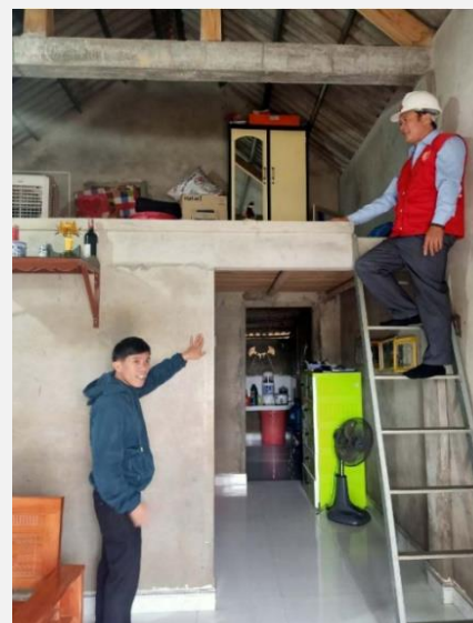
A mezzanine being built.

Majority of affected households being interviewed in the latest assessment emphasized that they preferred flood resistant houses rather than initially proposed floating houses which can be swept away in strong winds and strong flow of water that prevails in these locations. The flood resistant houses with two proposed designs (mezzanine or attic on top of existing houses - see above) are higher than annual flooding levels with a total area not less than 30 square meters, providing a safe storage and evacuation place during floods and storms.