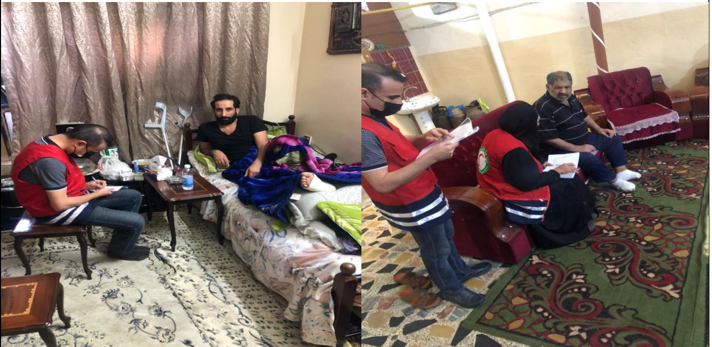
Figure 3 IRCS volunteers visit to injured persons for first aid/dressing and verification

Following the explosion in Al-Tayaran Square, the injured suffered from the shock of the explosion and needed to be visited at home for primary health care. Because the affected people are not all in the same governorate, tracing the affected families is a major challenge in the response. After the explosions, the dead and injured were shifted to their hometowns in different governorates. As a result, the volunteers and staff spent more time tracing the affected people and individuals than they did with the standard post-disaster PSS program; these interventions are more focused on the home.