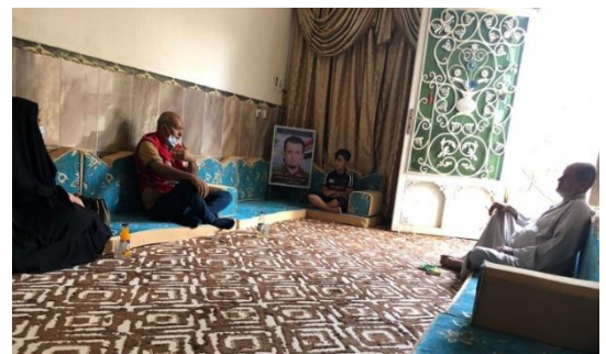
Figure 1: IRCS volunteers visits to the affected families

On January 21, two explosions occurred in Tayaran Square in central Baghdad's Bab al-Shaqi neighborhood. At least 33 people have been killed and 100 have been injured in these attacks. According to an Iraqi interior ministry official, the first suicide bomber raced into the market and pretended to be unwell so that people would congregate around him. Then he detonated his explosives. A second attacker exploded his device as bystanders gathered around the victims, according to the ministry's statement. The dead and injured have been confirmed by Baghdad's Directorate of Terror Victims and Directorate of Health. Iraqi government emergency officials came on the scene to assist the victims.