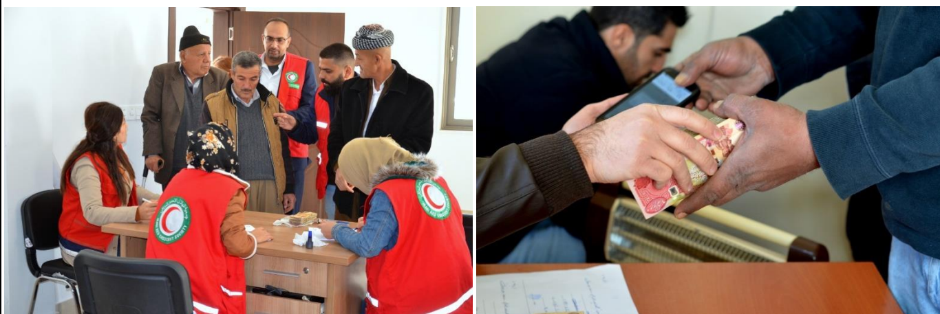
Figure 2 IRCS team supporting affected families with cash assistance

To assist the implementation process, a cash working committee was established at the headquarters to validate the data received from the Directorate of Terror's Victims and Directorate of Health, Baghdad in consultation with the local branches.