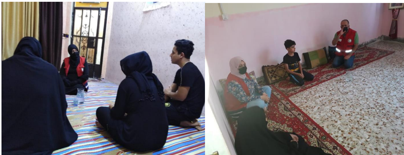
Figure 4 IRCS staff and volunteers are organising PSS sessions with affected families at governorates level

The key challenge in the operation is reaching out to those families and verifying the affected individuals in the targeted governorates – based on the list provided by Baghdad's Directorate of Terror's Victims and Directorate of Health. As a result, volunteers and staff must spend more time with each family and individual than they would in a typical post-disaster PSS activity, and the interventions are more household-focused.