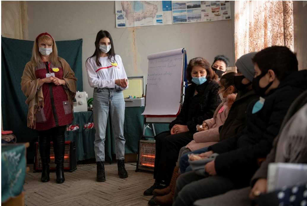
Image 3: Conducting psychological group work with people displaced.

It is noteworthy, that according to the original workplan it was planned to support 6,800 people with food supplies for 2 months. However, continuous assessment and observation of the situation on the ground suggested that the post-escalation situation was changing rapidly, the people who originally arrived from NK moved from one community to another, and a large part of them decided to return to the NK. Thus, the decision was made to provide food supplies to the targeted families for 15 days instead of 2 months and target 33,200 individuals instead of 6,800 (as outlined in greater detail in DREF Operation Update no. 1 - Armenia: Supporting people affected by the escalation of the Nagorno-Karabakh conflict (MDRAM007) ).