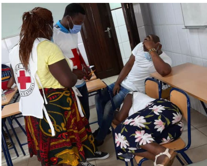
Figure 1: Simulation exercises during psychological first aid training.

The 44 volunteers deployed were trained in psychological first aid, advanced first aid to provide relief to the victims. The same volunteers were briefed on community engagement, to make sure that Community Engagement and Accountability (CEA) aspects are taken into account throughout the operation, and to ensure the involvement of the whole community and good complaint management. It should be noted that all volunteers involved in this operation were insured, briefed on the Code of Conduct and equipped with masks and hydro-alcohol gel.