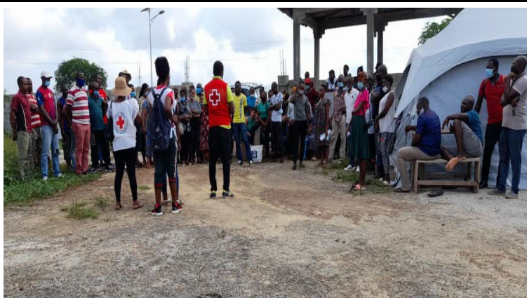
Figure 2: Registration of beneficiaries in Nakuantoma 2

Volunteers will be trained in distribution in the coming days, by mid-July as soon as the logistical procedures are finalised. They were delayed because they were first registering the beneficiaries. Indeed, registration ended on Friday 25 June 2021 with the taking of photos of family heads. This activity was greatly slowed down due to the heavy rains which made it difficult to access the areas where the beneficiaries were located.