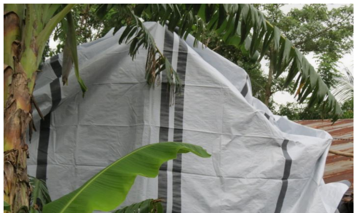
Tarpaulin used as a temporary protection from rain and open sky for those who have lost their shelter.

As mentioned above, beneficiary selection, registration process and distribution of cash and jerry cans for 4,000 families were completed on 30 May 2013. This also applied to the distribution of shelter materials. Each family received two tarpaulins. The beneficiary selection of the remaining 1,000 families will be initiated soon.