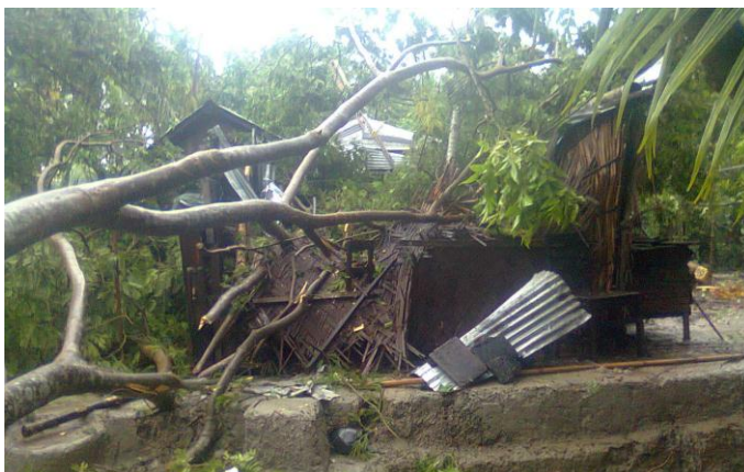
Uprooted tree causes huge damage to shelter in all most affected three districts.

Cyclonic storm Mahasen hit ten west central coastal districts on 16 May, affecting 1,498,579 people and leaving 17 people dead. On 15 May a total of 956,672 people were evacuated to safer places like cyclone shelters. Most of these evacuated populations returned to their homes though some of them are still in cyclone shelters as the homesteads are flooded with tidal surges caused by the cyclone. As per the government's information as of 26 May, a total of 26,577 houses have been completely destroyed and 124,428 houses are partially destroyed.