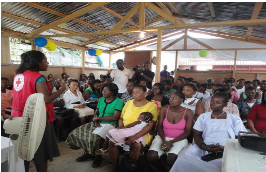
HRCS sensitized women during the International Day for the Elimination of Violence against Women in Carrefour Feuilles, Port-au-Prince.