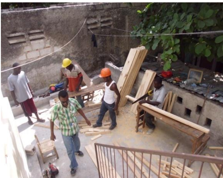
Some of the beneficiaries of the skills acquisition programme have set up their own businesses with IFRC-donated start-up kits.

Progress: the has donated 466 tool kits to individuals who had previously attended training in culinary skills, tailoring, carpentry, masonry, cosmetology, plumbing and electrical work. These kits were also accompanied by small business training and support to better advertise beneficiaries' products so that they can market themselves better within the community and the general market place. Through the Fonkoze (local micro-finance organization), four small and medium enterprises were given financial support to improve their business, these include a metal workshop, community restaurant, dry cleaning service and a bakery, all of which are based in the communities of Delmas 30 and Carrefour Feuilles.