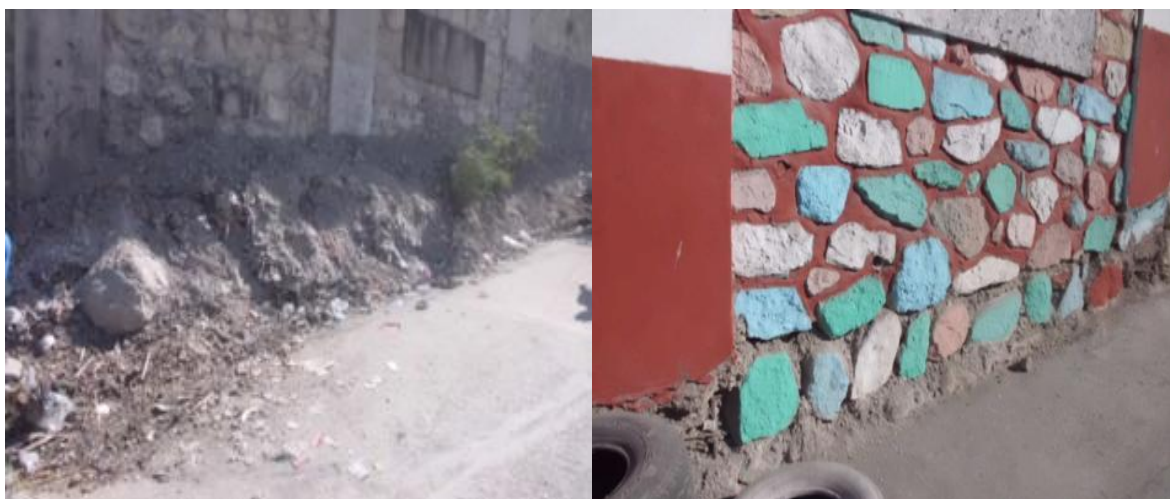
One of the streets cleaned and beautified by the community in Carrefour Feuilles (On the left is the state of the street before and on the right is the street after the exercise. IFRC

During the 2012 International Hand Washing Day in November, the IFRC disseminated information on good hand washing practices in public places including markets and schools, and provided four primary/secondary schools with 25 plastic buckets with lid and tap which are now used as hand washing points by the beneficiaries. The IFRC team also disseminated messages to reduce discrimination against people living with HIV to commemorate the World AIDS Day in December. The Day's activities were carried out in collaboration with the Haiti Red Cross Society's Kote Trankil (violence prevention) project team which delivered messages on tolerance, anti-discrimination.