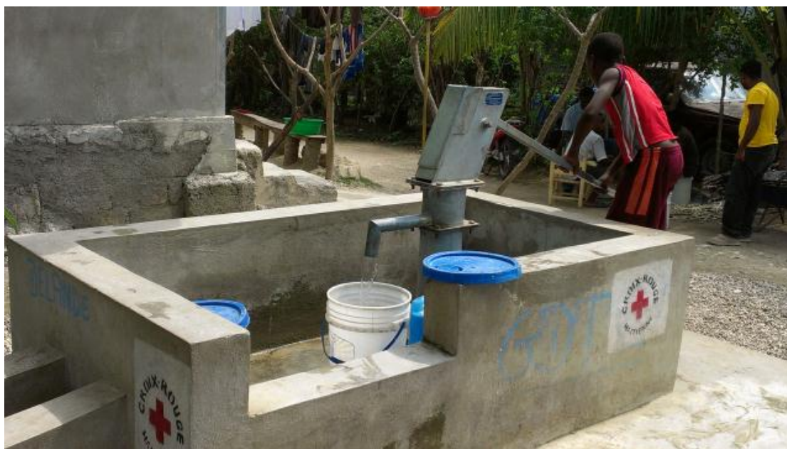
One of the newly constructed boreholes in Leogane.

The Hurricane Sandy that hit Haiti during this reporting period impacted on the implementation of activities planned as the water and sanitation team was mobilized and deployed to respond to the Sandy emergency. In addition, social events in Leogane which often lead to blocking of roads made access to communities difficult and thereby causes delay in implementation of activities.