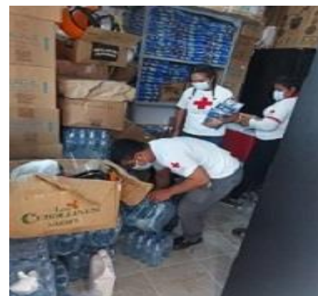
Facilitators of the GRC Migration Programme, classifying and preparing inputs in preparation for the response, in Delegation Puerto Barrios, Izabal.

On 23 July 2021, the Guatemalan Institute of Migration (IGM) shared information regarding an alert issued about a possible mass movement ("Caravan") of 12,000 people arriving from Honduras at the end of July. The migration authorities are carrying out inter-institutional coordination activities to address it comprehensively according to the capacities of each institution. Emphasis is made on the importance of attending in a dignified and prioritized manner to vulnerable groups that could be part of this