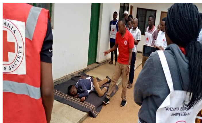
First aid training to volunteers

TRCS deployed 800 volunteers from the initial planned 300 volunteers who provided First Aid and Psychosocial support during campaigning, election, and announcement day. TRCS stationed 1 many vlu,000 volunteers at all mapped out hotspot areas before, during and after the elections. The number of people requiring first aid services as a result of clashes with police, though not reported in the mainstream media and with blocked social media pages, was very high. This necessitated the deployment of additional 500 volunteers to support the initially deployed 300 volunteers. Risk Communication and Community Engagement (RCCE) were integrated in the response, to advocate for preventive measures during the election process, including the