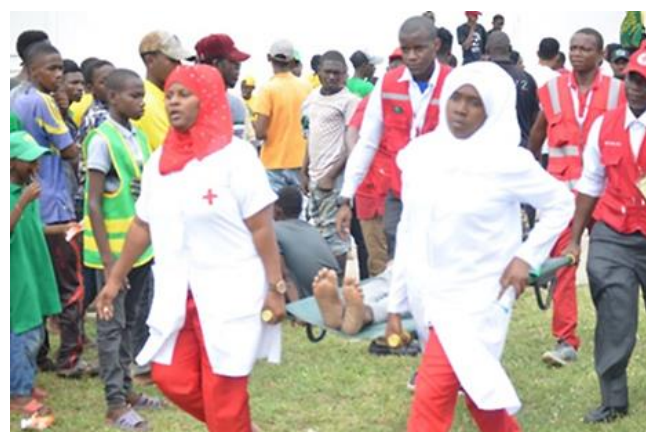
TRCS volunteers evacuating a casualty

Ahead of October 2020 national Presidential Elections, Tanzania Red Cross Society (TRCS) was granted CHF 142,233 for a DREF operation from the DREF Fund of the International Federation of Red Cross and Red Crescent Societies (IFRC), in line with its 2020 national general election contingency plan that focused on both preparedness and response to likely pre and post elections violence. Agreed activities included provision of First Aid (FA) and Psychosocial support (PSS), dissemination of RCRC Principles and peace promotion and provision of emergency WASH services.